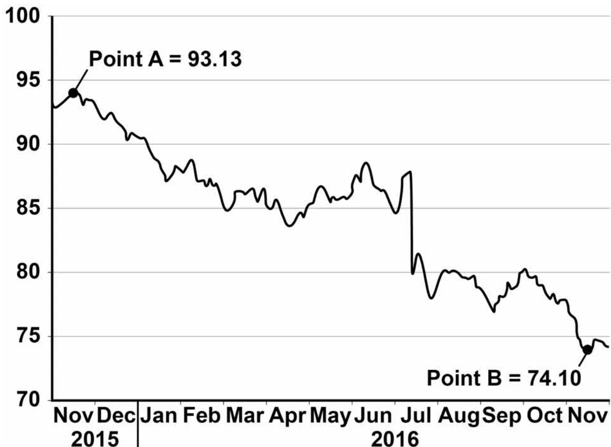
FIGURE 1: Sterling effective exchange rate index, November 2015 to November 2016