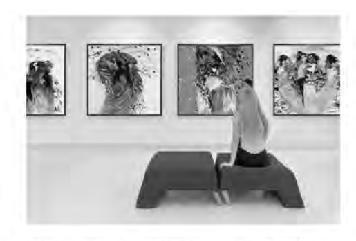
Im Nolde Museum in Seebüll im nordfriesischen Schleswig-Holstein wird Kunst zu einem Rundum-Erlebnis.