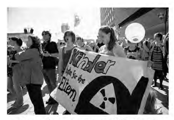
Jugendbewegung gegen Atomkraft