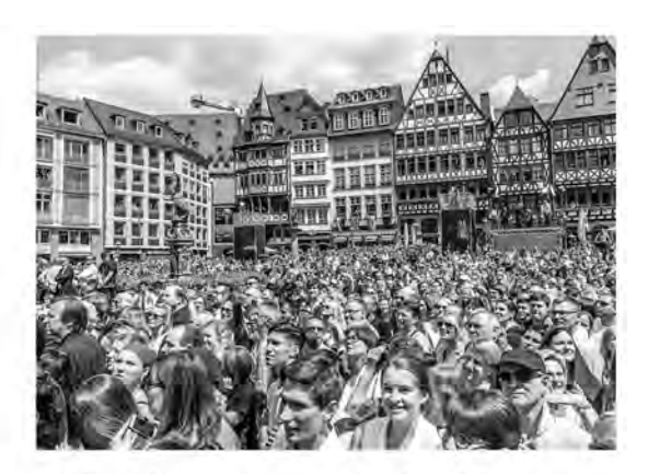
Abendveranstaltung in Frankfurt zum 25. Jahrestag der Wiedervereinigung

Pläne für die große Feier 2018 in Berlin Wo: Straße des 17. Juni (Berlin-Mitte) Wann: Mittwoch, 03.10.2018