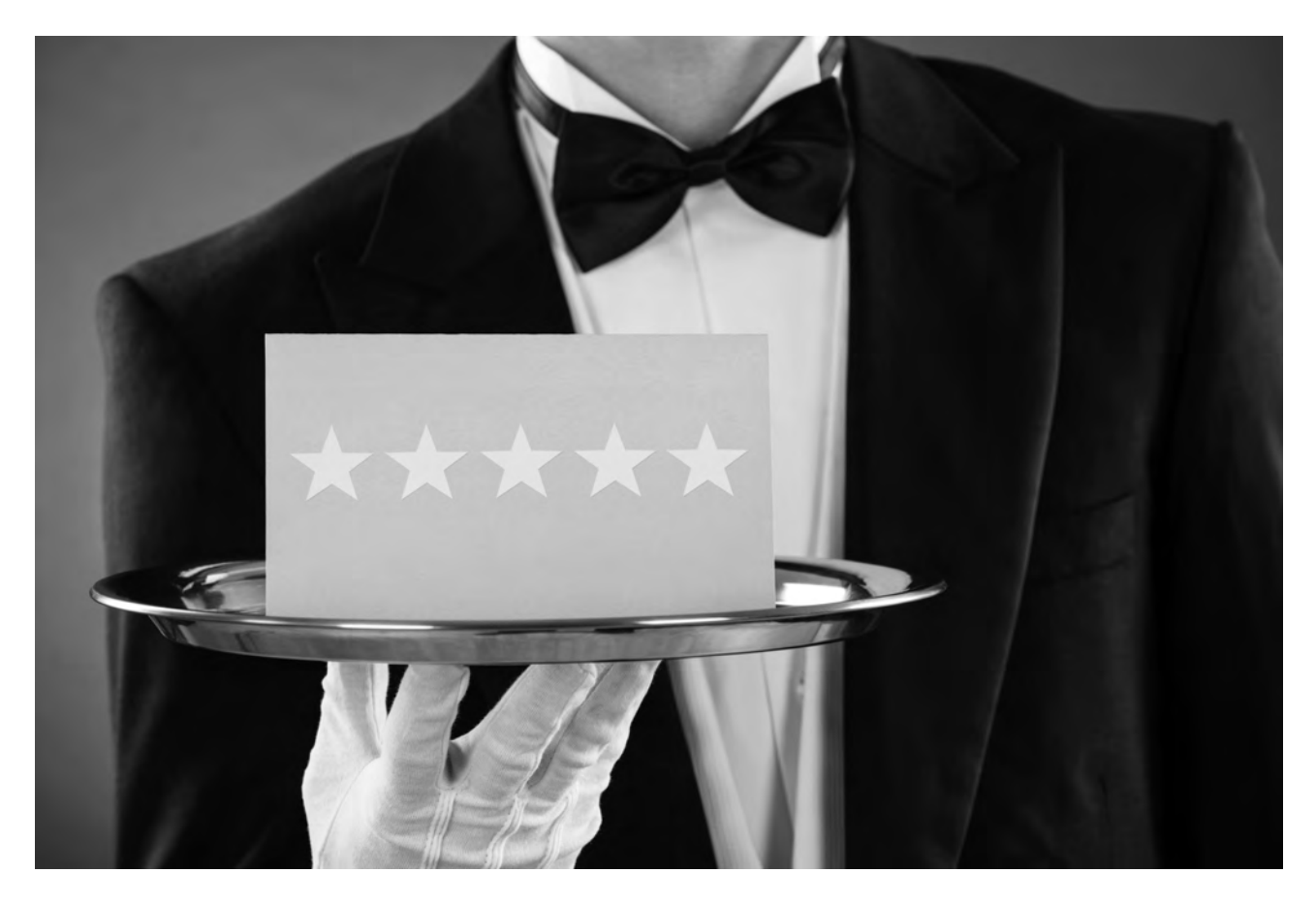
Surprise! C'est la Suisse et pas la France qui reste le pays avec le plus grand nombre de restaurants étoilés par habitant en Europe : 117 établissements ont reçu au moins une étoile dans l'édition 2017 du guide Michelin. La Suisse progresse donc de plus de 20% en cinq ans confirmant la diversité extraordinaire de la gastronomie suisse.