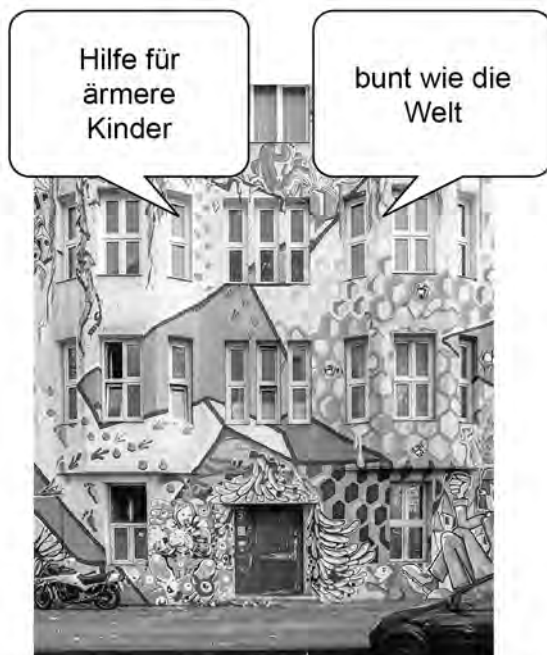
Das Kunsthaus von KRASS in Düsseldorf