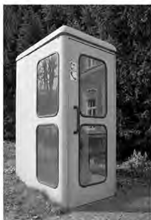
Eine alte Telefonzelle.....

Seit vier Jahren gibt es in Berlin an zwei Standorten eine ‚Teledisko‘ – die kleinste Diskothek der Welt.