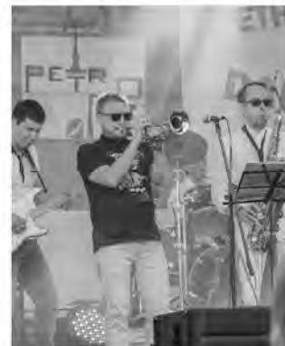
Live-Musik mit Jazz-Gruppen