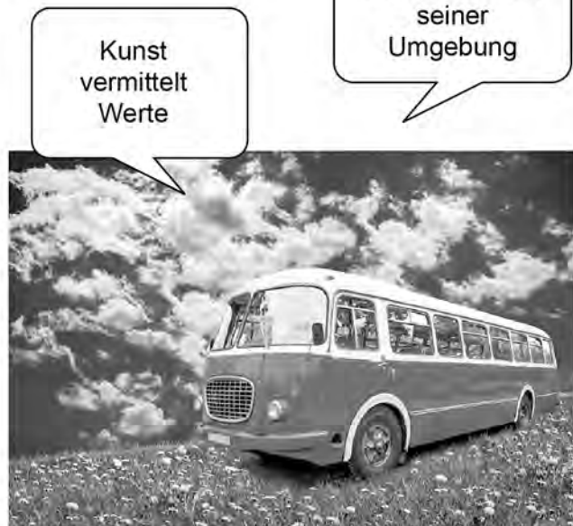
Mit dem Kunstbus unterwegs in der Region