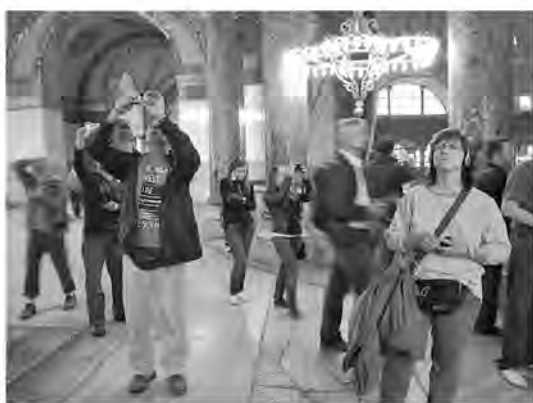
Besucher in der Berliner Moschee