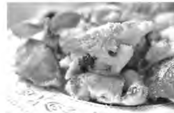
traditionelles Essen aus der Region