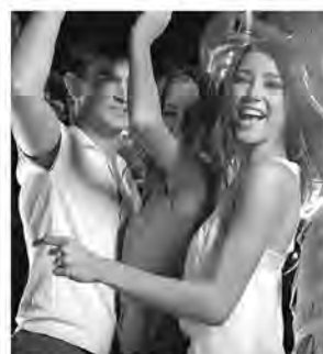
....umgebaut zu einer Disko mit