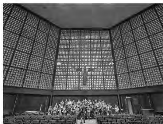
Kaiser-Wilhelm-Gedächtniskirche am Breitscheidplatz

Teilnehmer von 100 Religionsgemeinschaften in Berlin