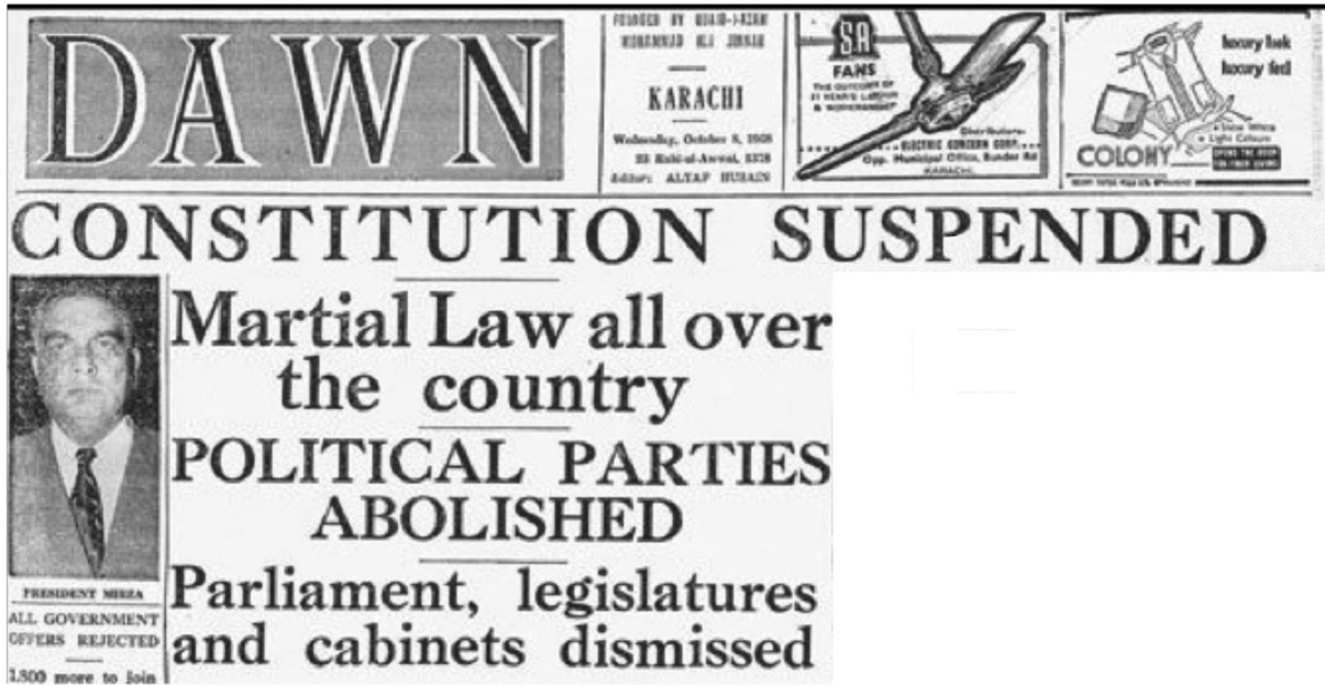
The newspaper 'Dawn' reports that Martial Law is announced in 1958.

Problems of national integration. Political mobilisation and events leading to independence