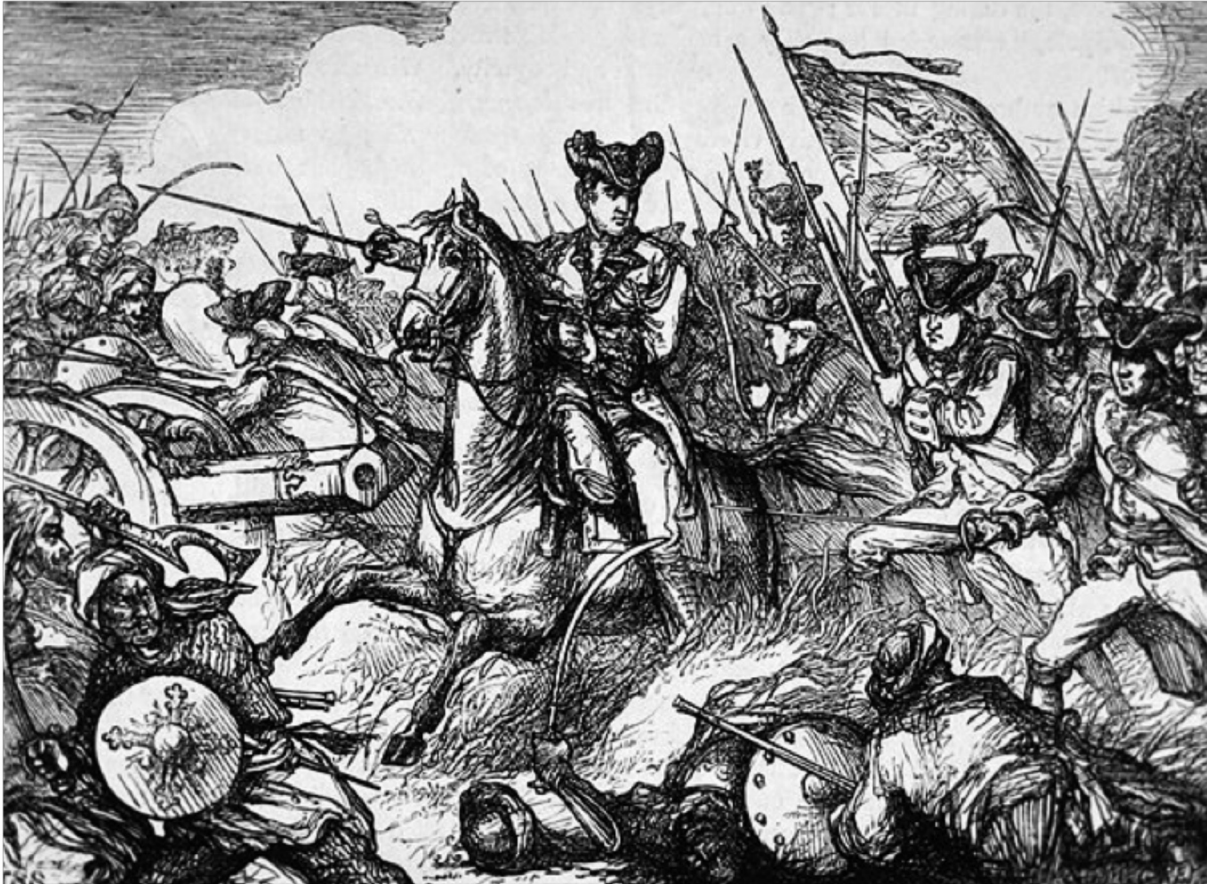
An eighteenth-century British print of the Battle of Palashi (Plassey)

During the war with France, which broke out in 1756, the British used internal divisions in Bengal to their advantage. They weakened the position of Sirajuddaula and when the disputes between the Nawab and the British led to conflict, it was the East India Company that was victorious. The decisive battle took place at Palashi in 1757. The British installed a puppet ruler in Bengal. British influence was extended by the acquisition of three districts in 1760 and by gaining the right to collect revenue. A treaty of 1765 allowed Bengal to be ruled by collaborators with the British in return for surplus revenues, but the rule of the Company did little for the people of Bengal. There was considerable hardship in the Great Famine of 1769–1770 and as a result of reforms to Company rule, such as the Permanent Settlement of 1793.