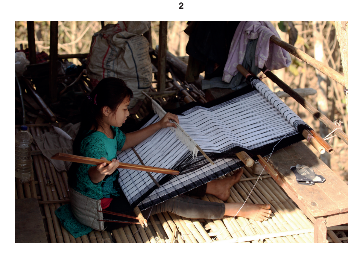
Photograph A for Question 4(a)