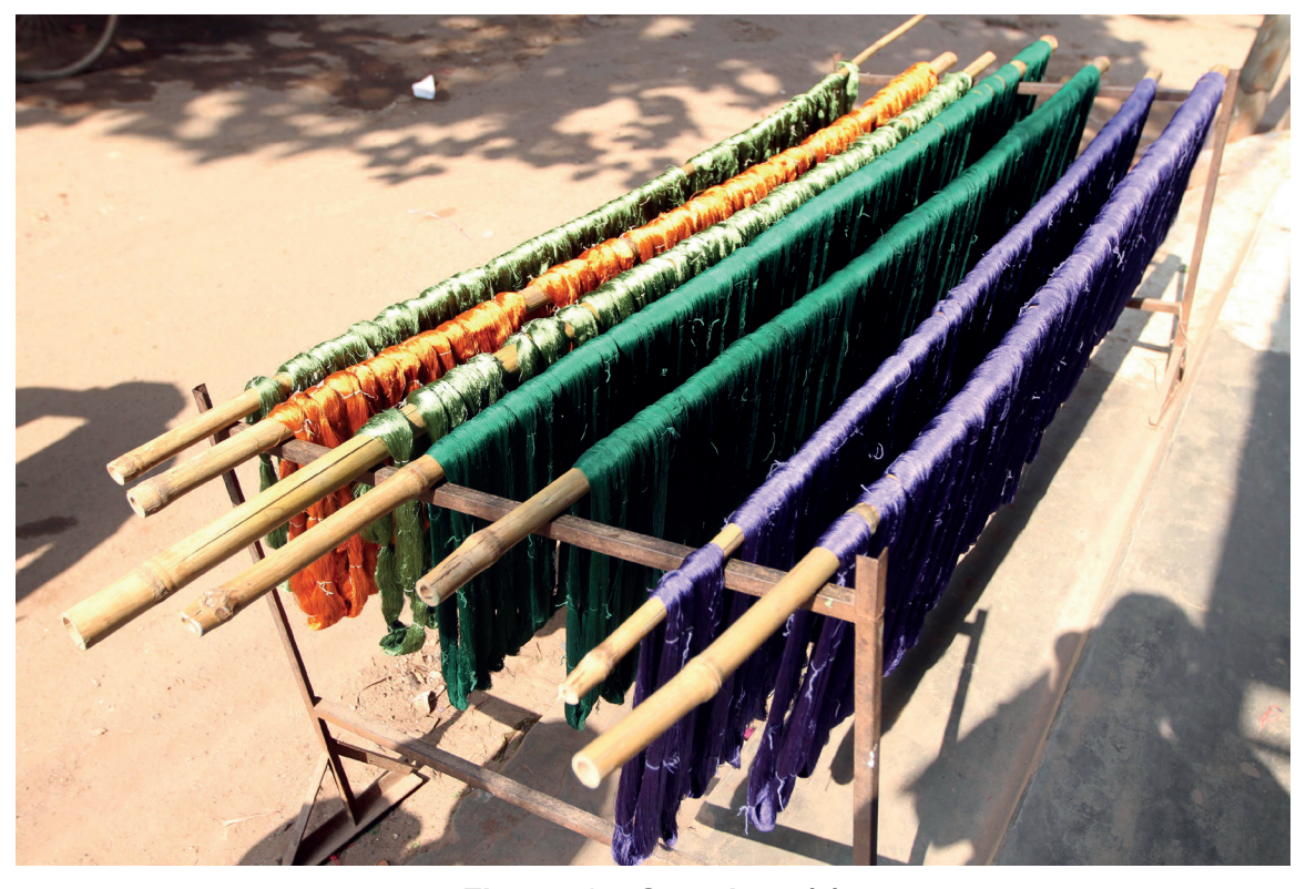
Fig. 5.1 for Question 5(a)

Permission to reproduce items where third-party owned material protected by copyright is included has been sought and cleared where possible. Every reasonable effort has been made by the publisher (UCLES) to trace copyright holders, but if any items requiring clearance have unwittingly been included, the publisher will be pleased to make amends at the earliest possible opportunity.