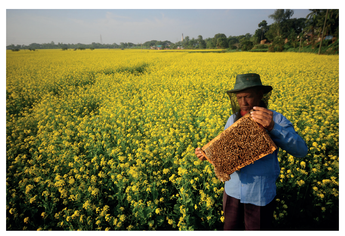
Fig. 4.2 for Question 4(b)