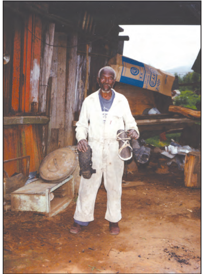
Fig. 4 A photograph which the student has taken.