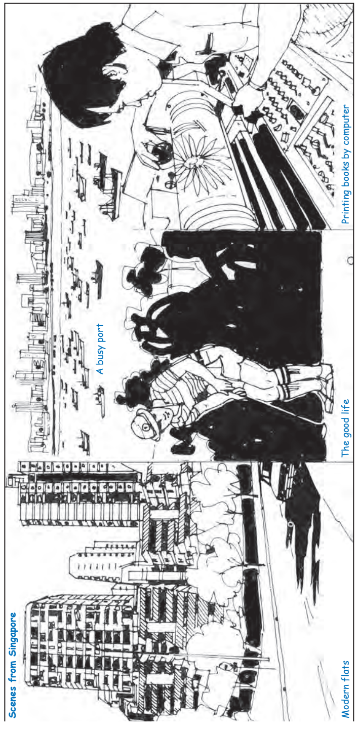
Scenes from Singapore

In time, shanty town districts may improve. But the problem is bigger day by day. Millions of people remain as poor as they were at the beginning.