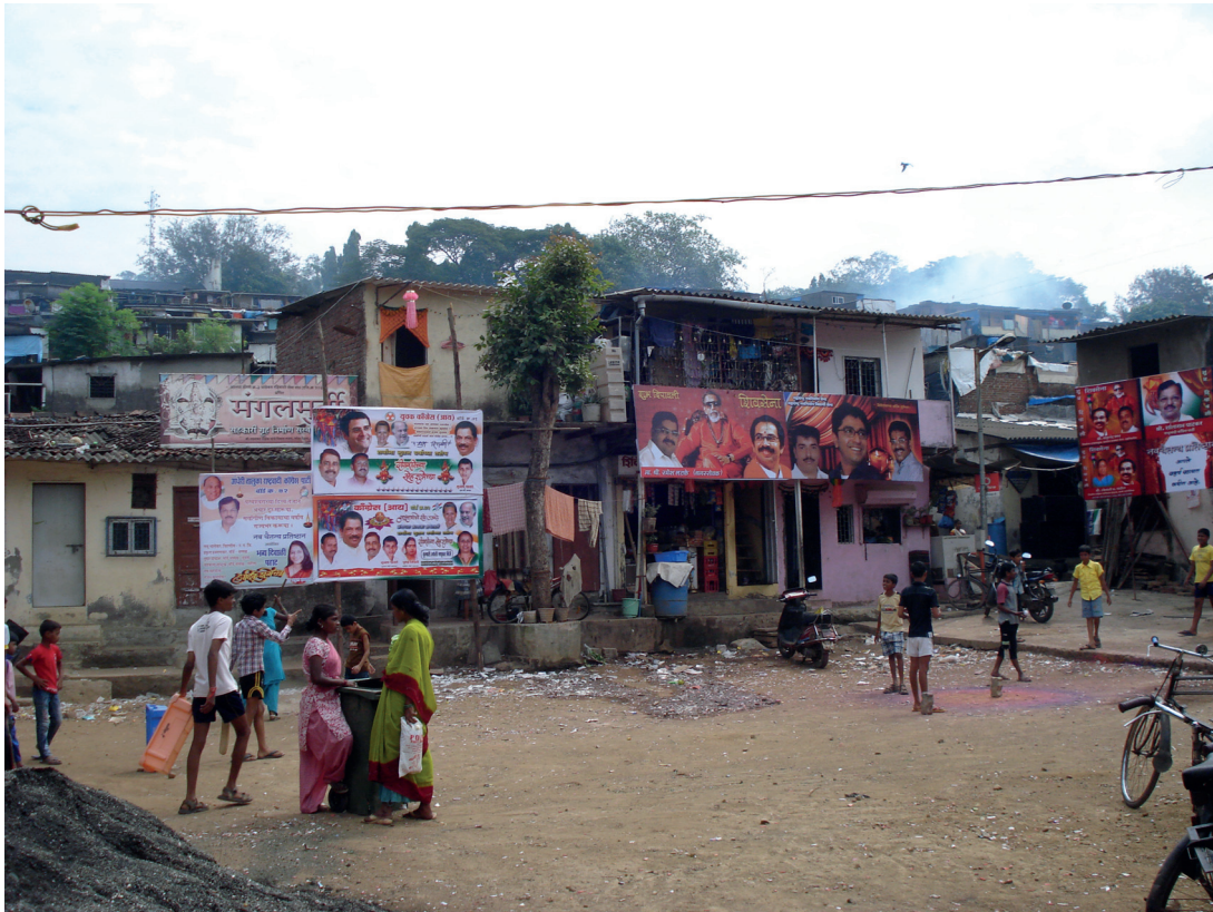
Photograph A for Question 3(a).