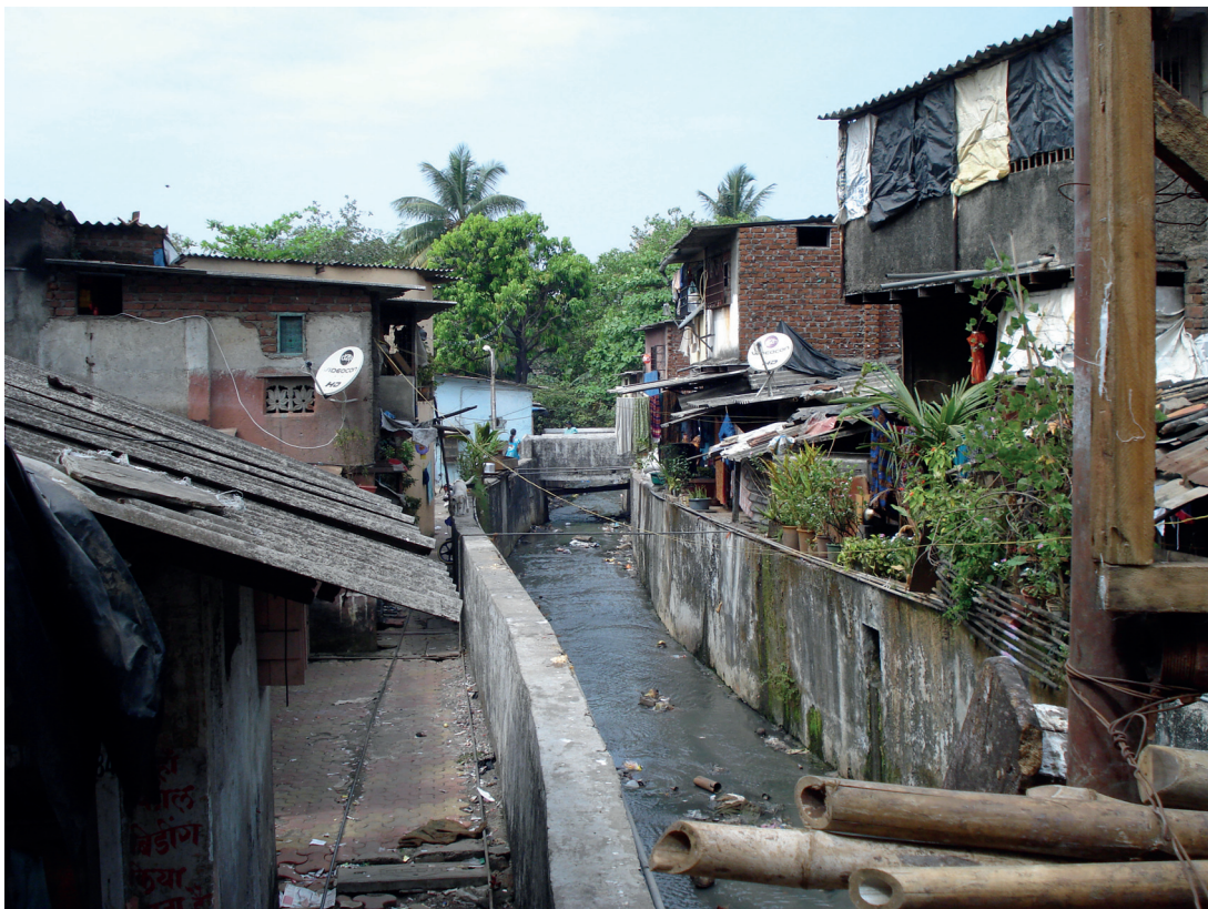
Photograph B for Question 3(a).

Permission to reproduce items where third-party owned material protected by copyright is included has been sought and cleared where possible. Every reasonable effort has been made by the publisher (UCLES) to trace copyright holders, but if any items requiring clearance have unwittingly been included, the publisher will be pleased to make amends at the earliest possible opportunity.