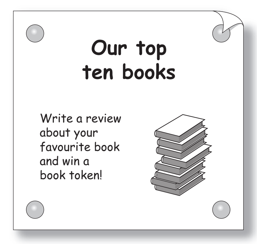
Part 3: Exercise 1

Your school magazine is compiling a list of popular books.