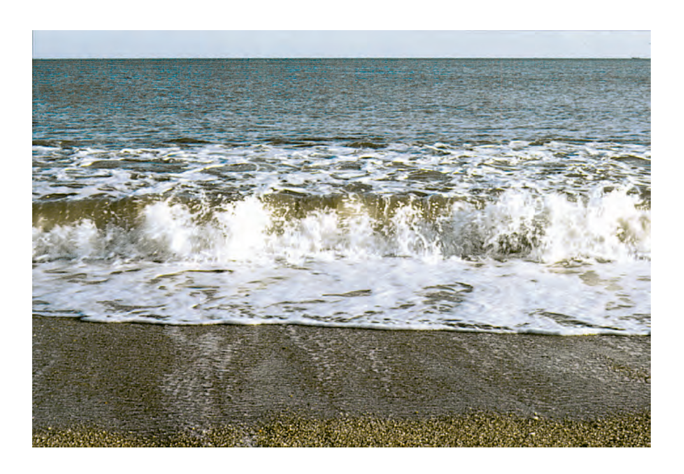
Photograph A for Question 3