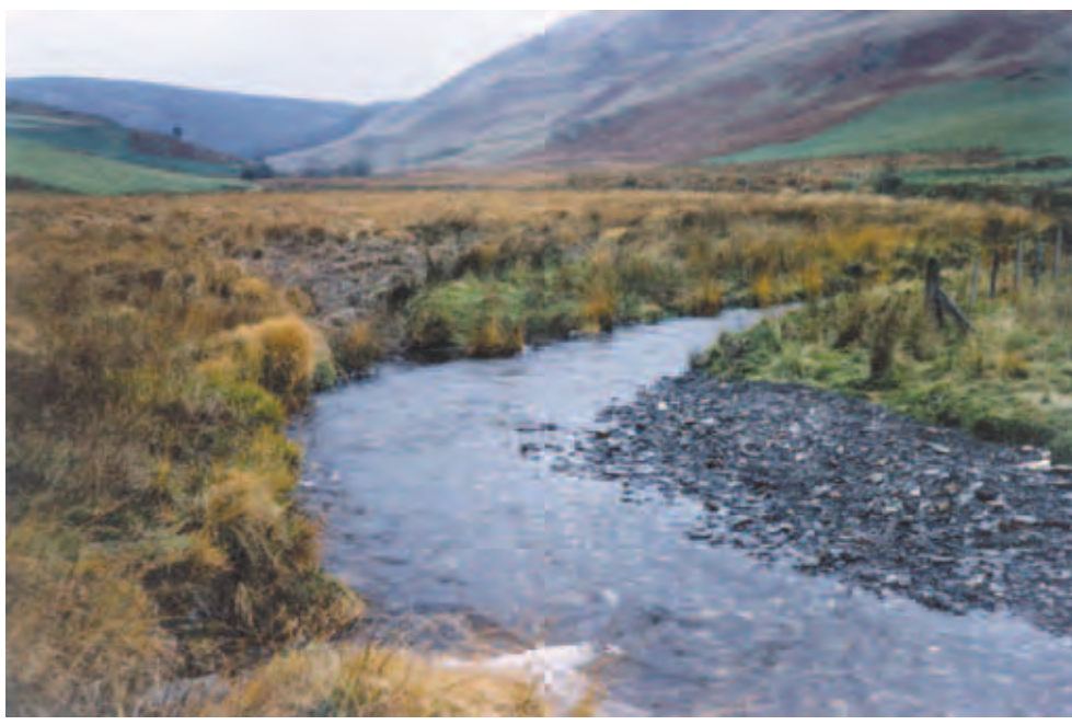
Photograph A for Question 2