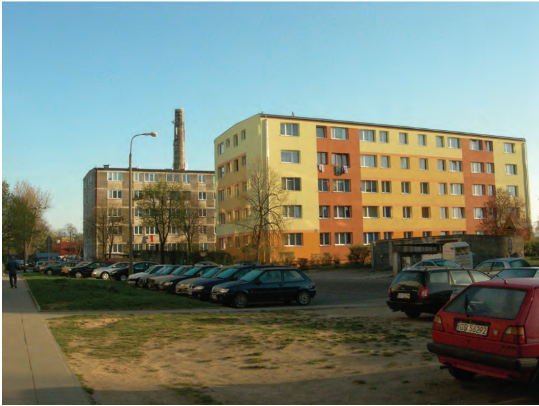
Photograph B showing area B for Question 2