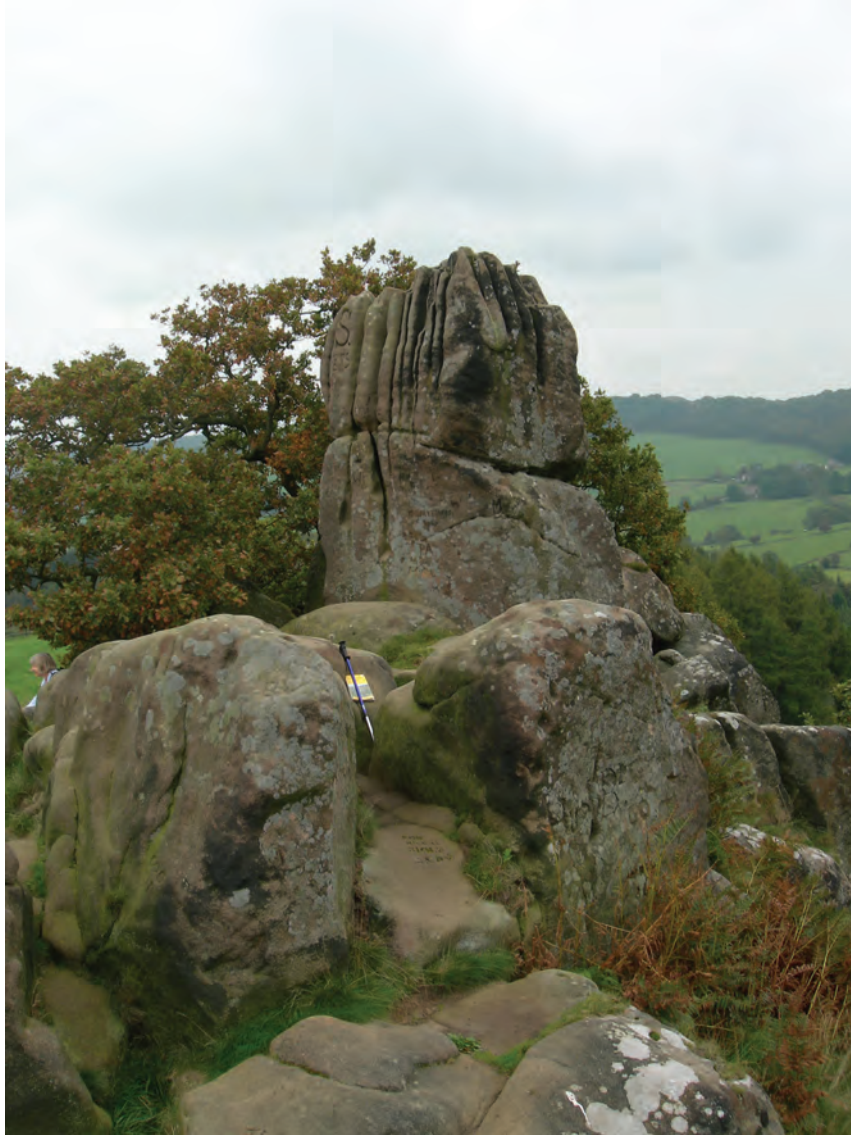
Photograph C for Question 4