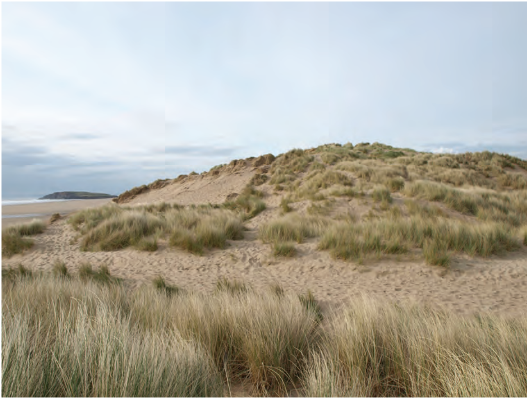
Photograph B for Question 3