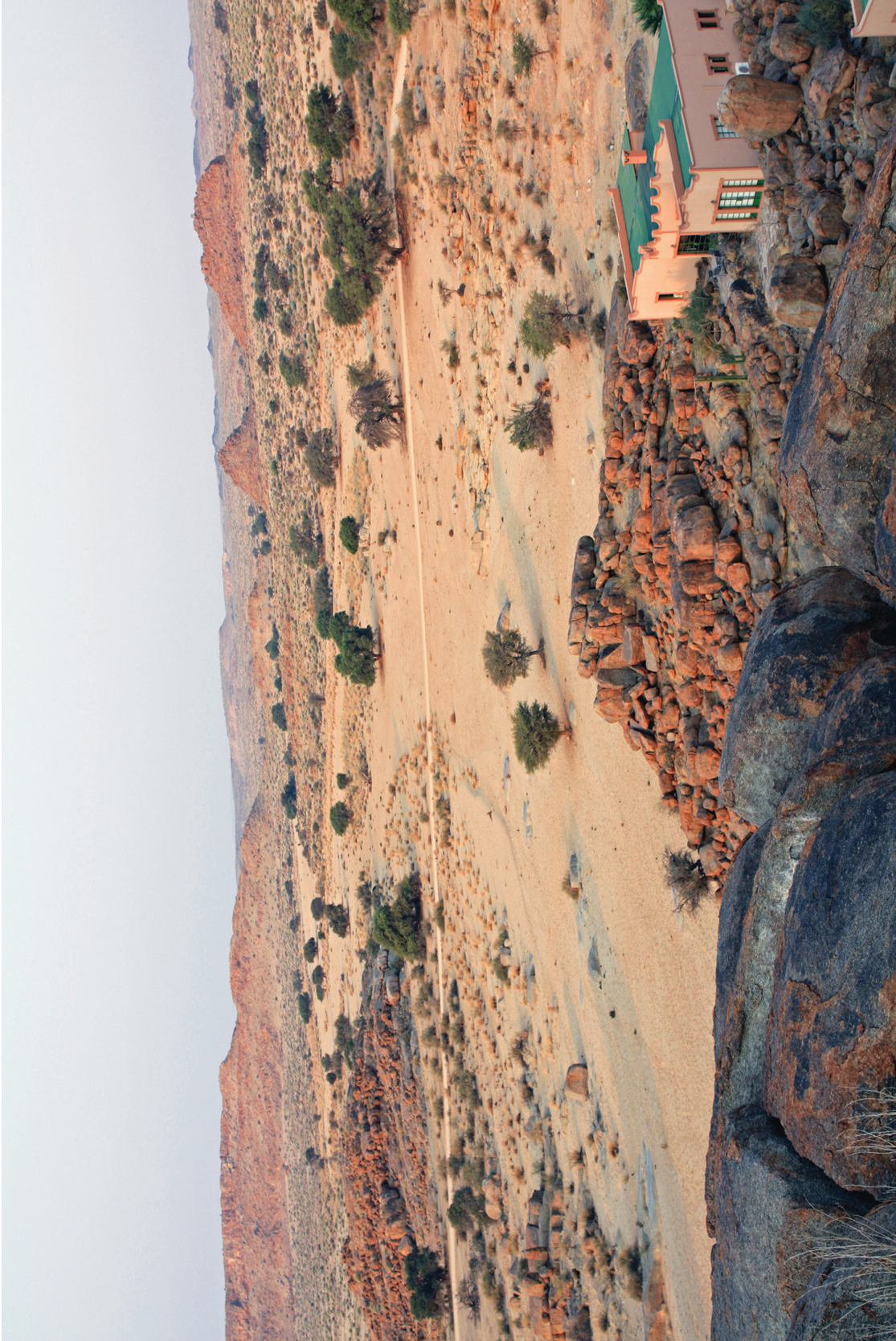
Photograph A for Question 3