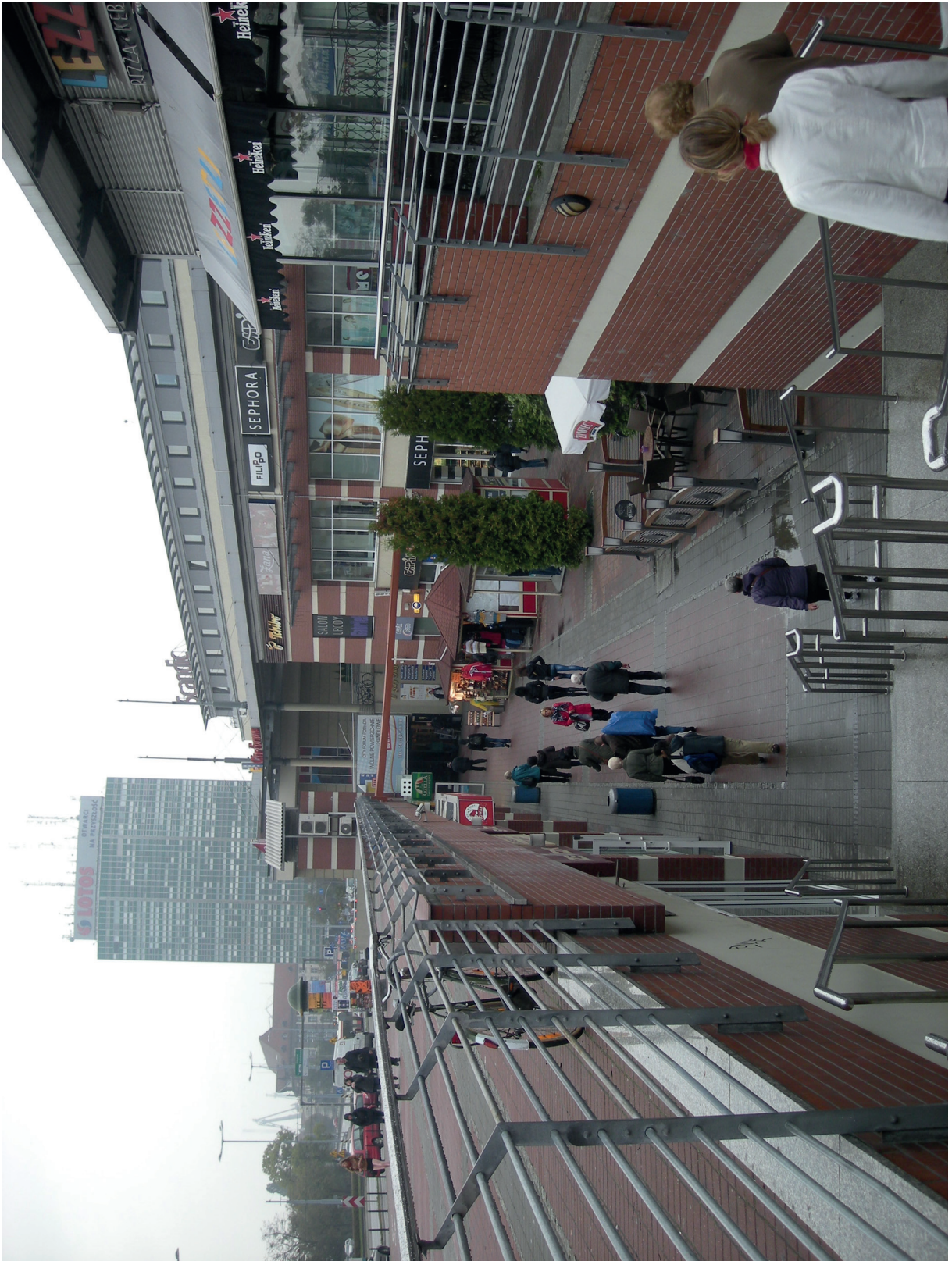
Photograph A for Question 2