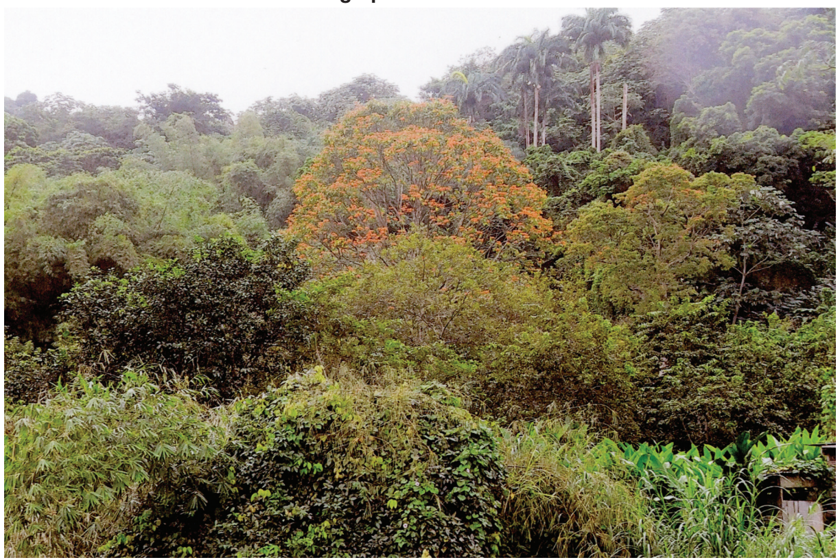
Photograph B for Question 4