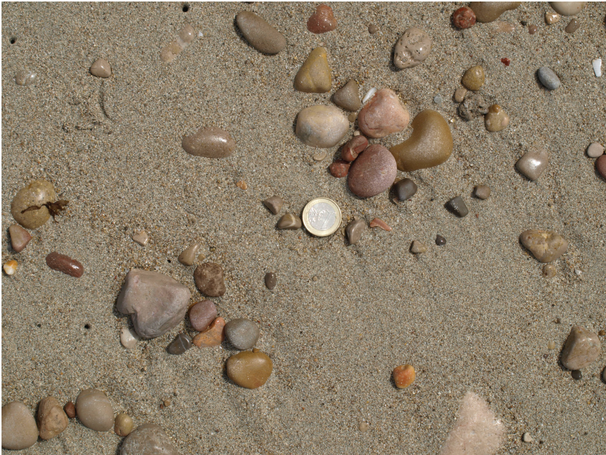
Photograph A for Question 3