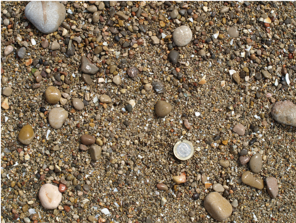
Photograph C for Question 3