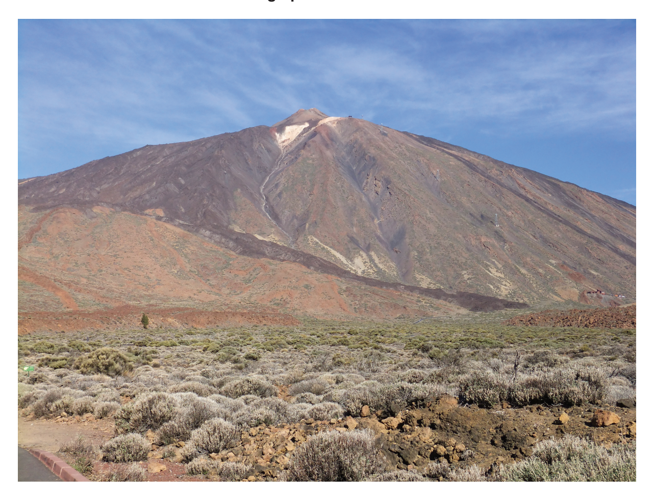
Photograph A for Question 3