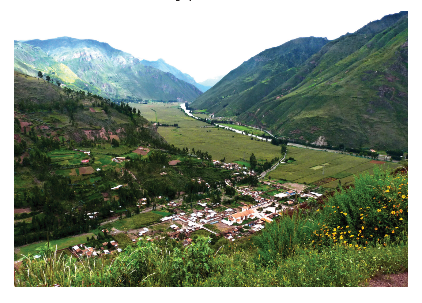
Photograph A for Question 4