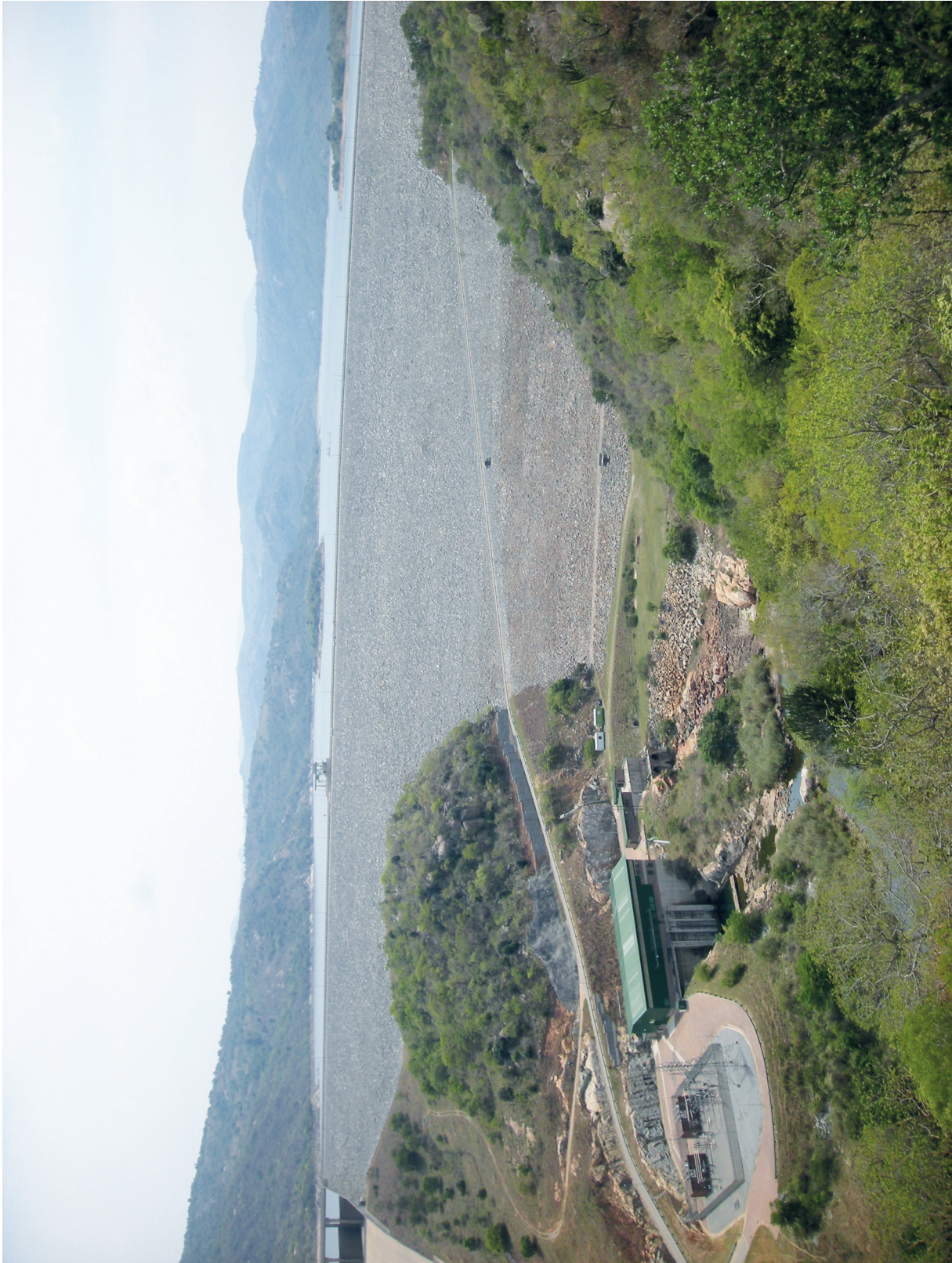
Photograph A for Question 5