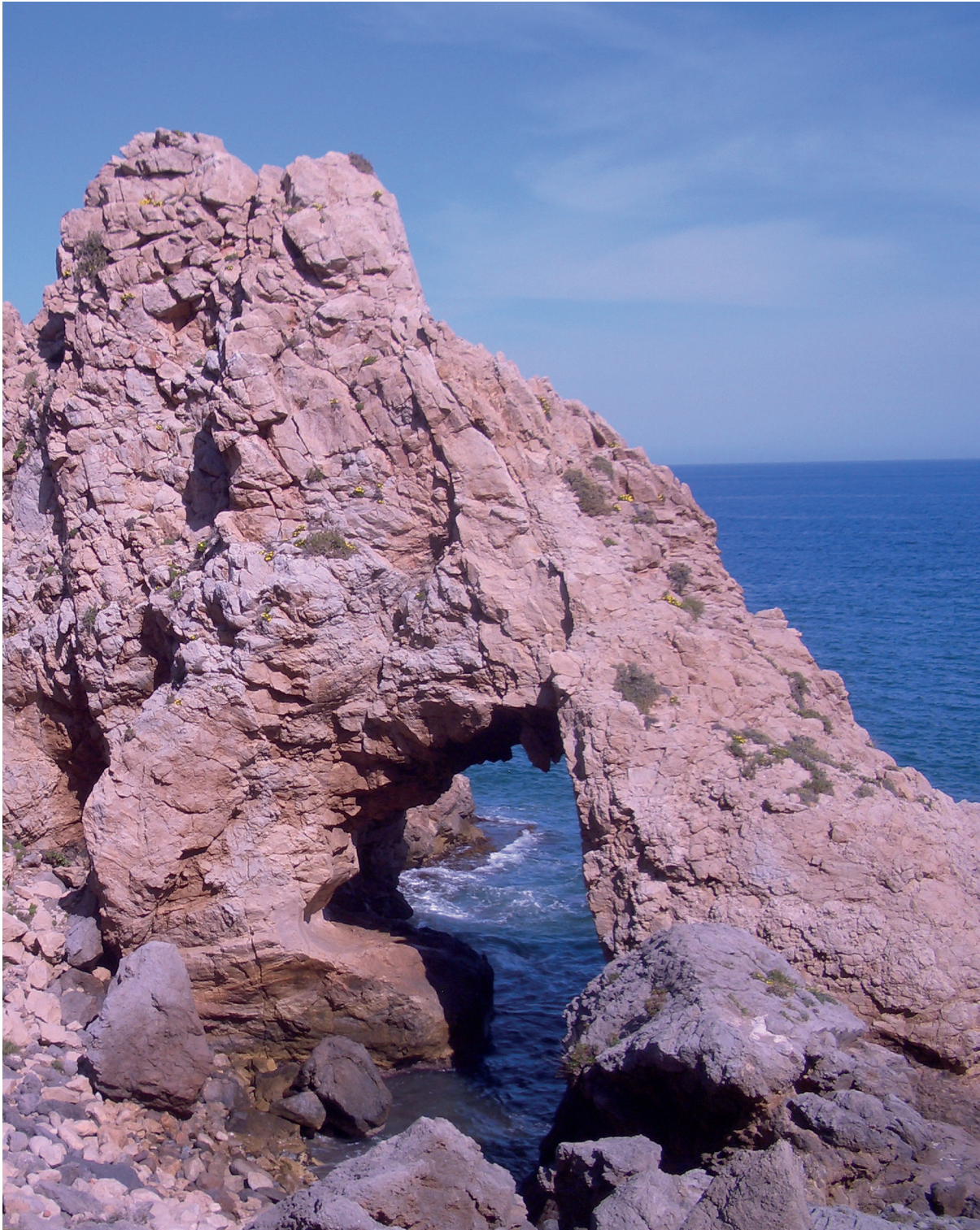
Photograph A for Question 3