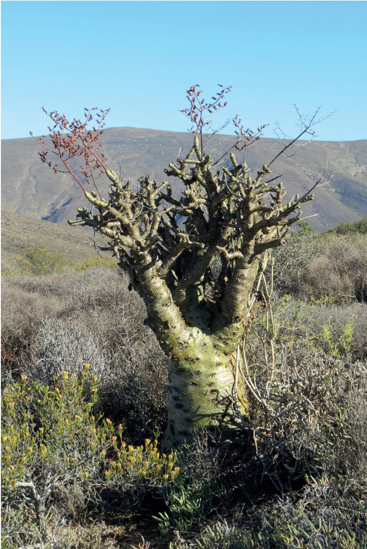
Photograph A for Question 4