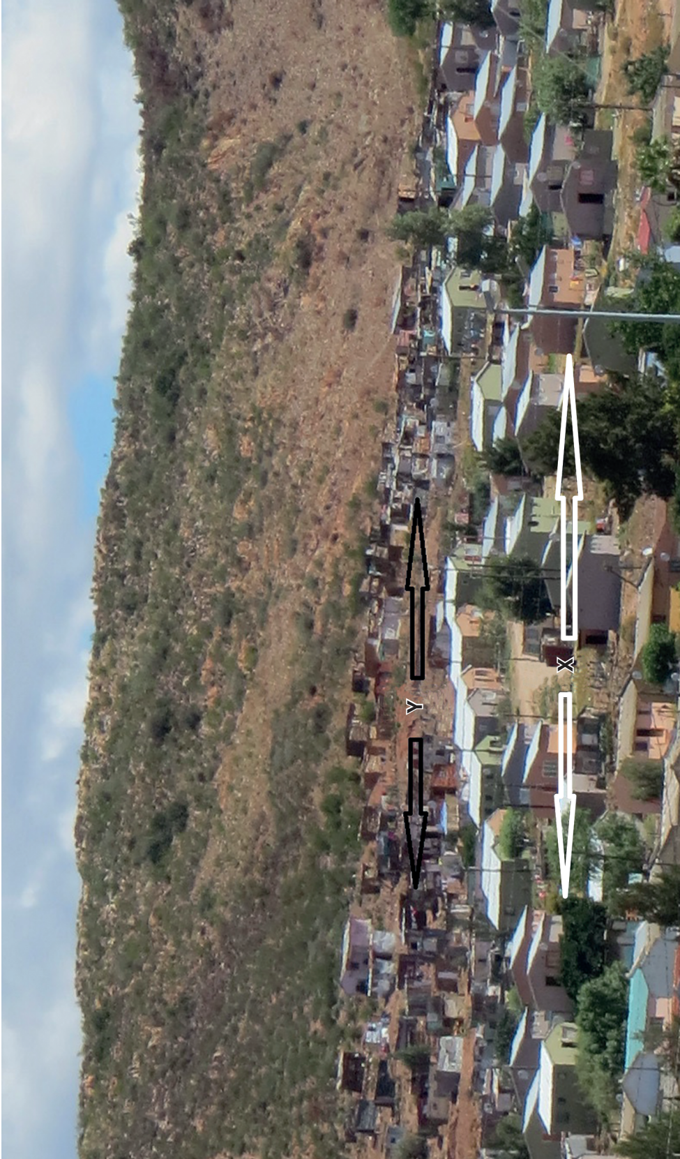
Photograph A for Question 3