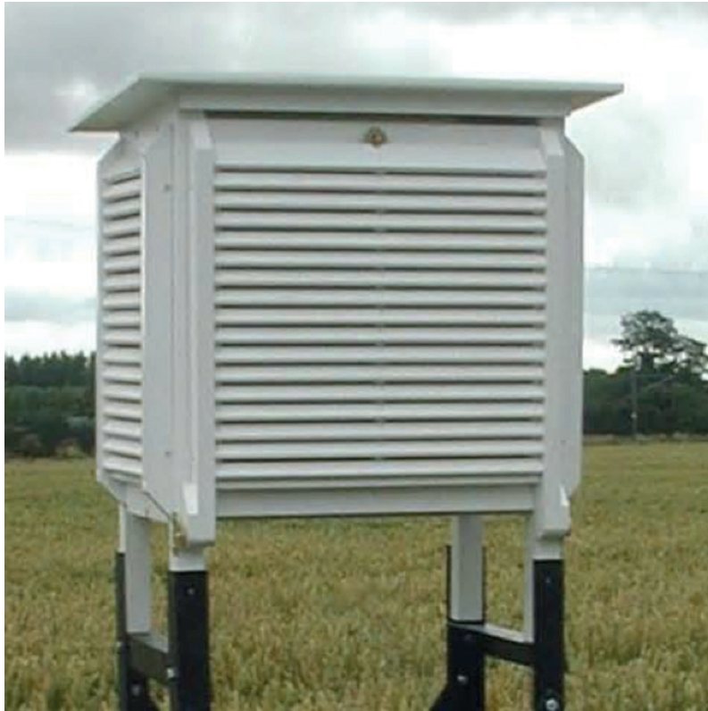
Photograph A for Question 1