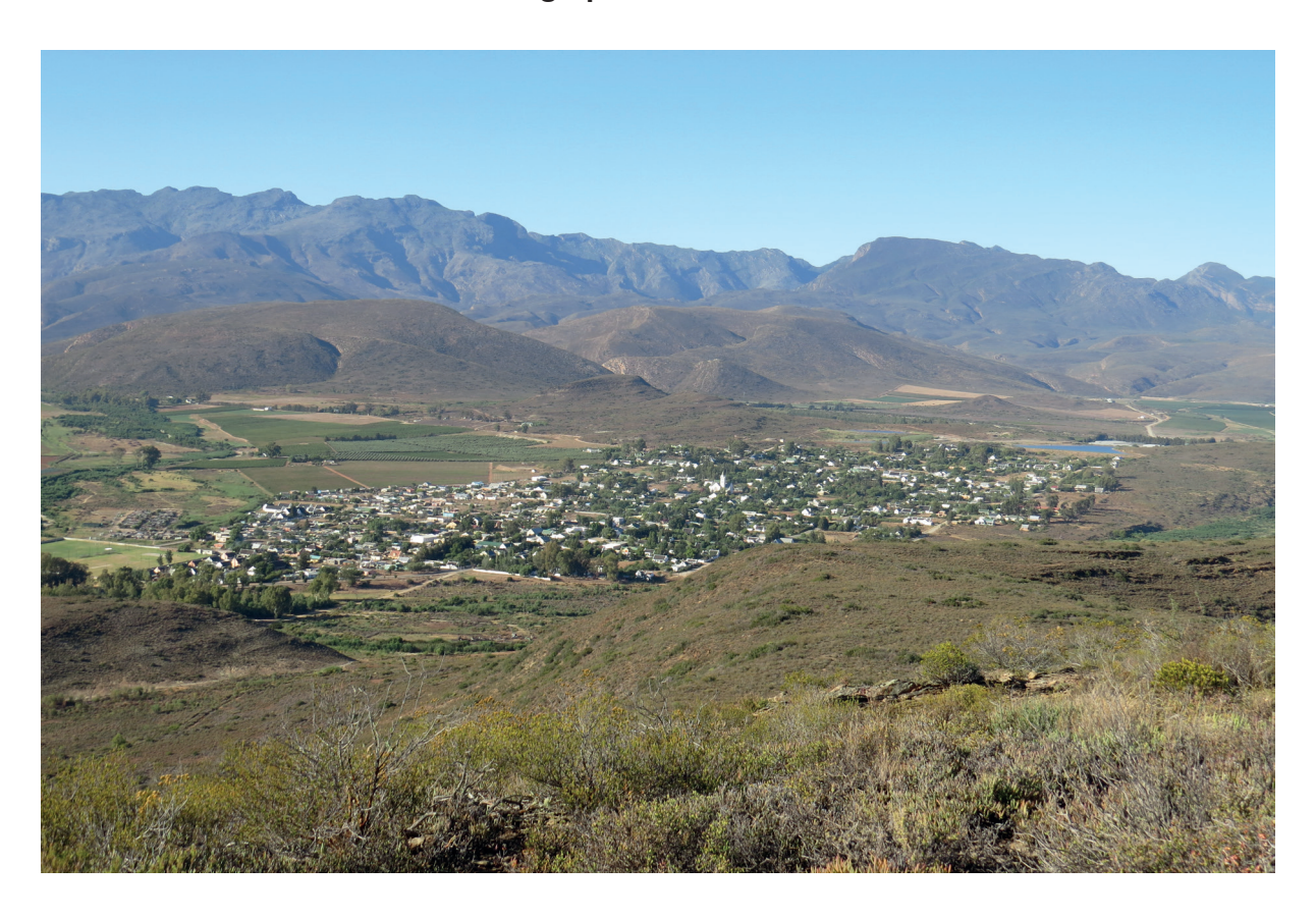
Photograph A for Question 3