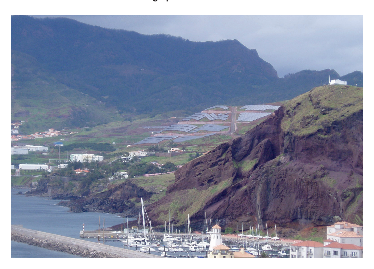
Photograph C for Question 6