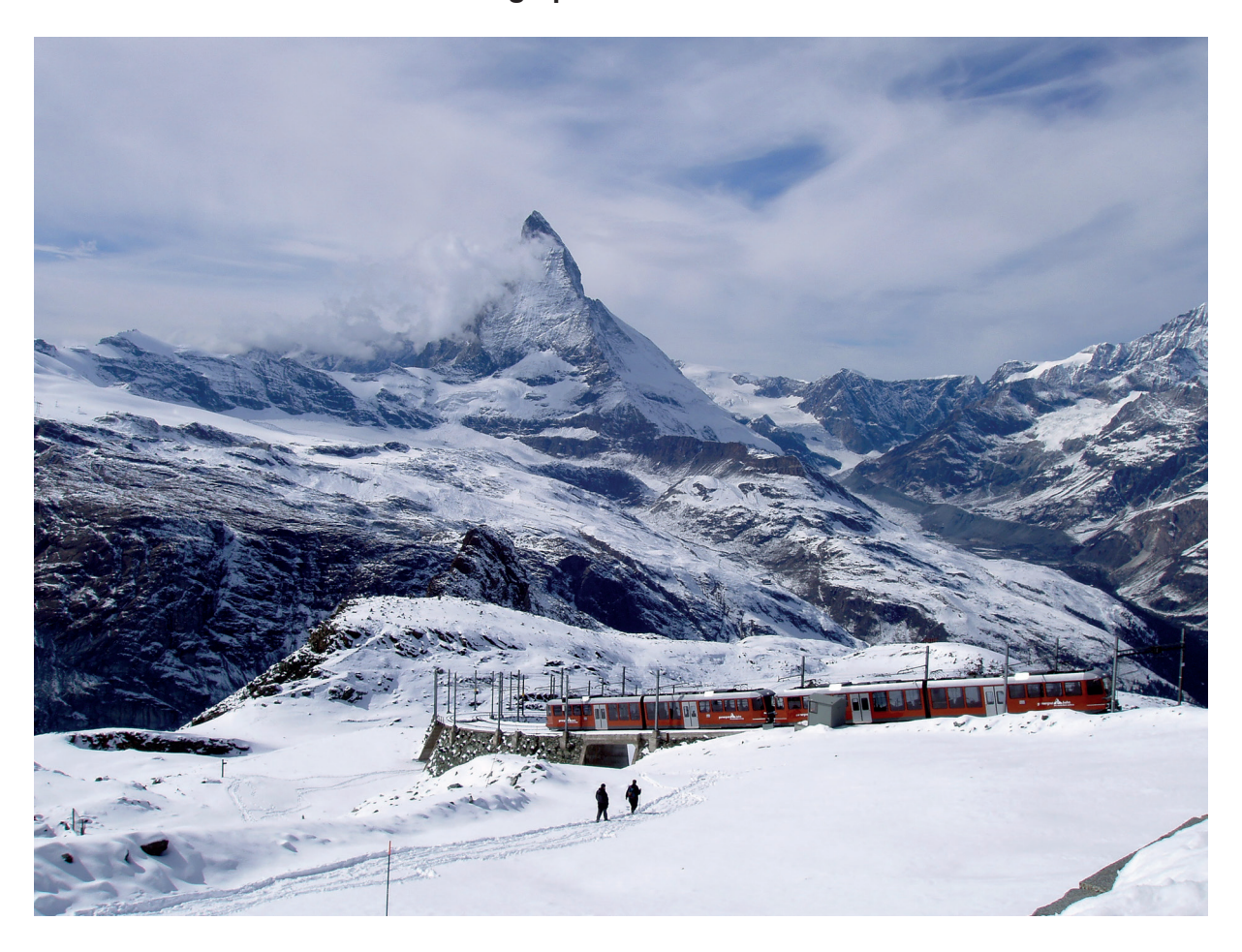
Photograph A for Question 2