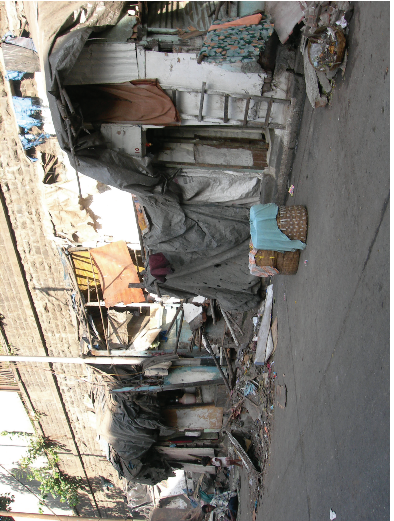
Fig. 2.2 for Question 2