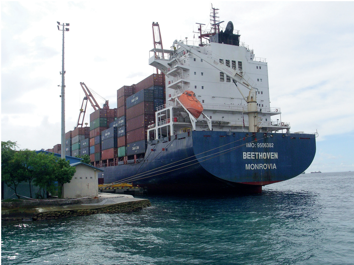
Fig. 3.3 for Question 3