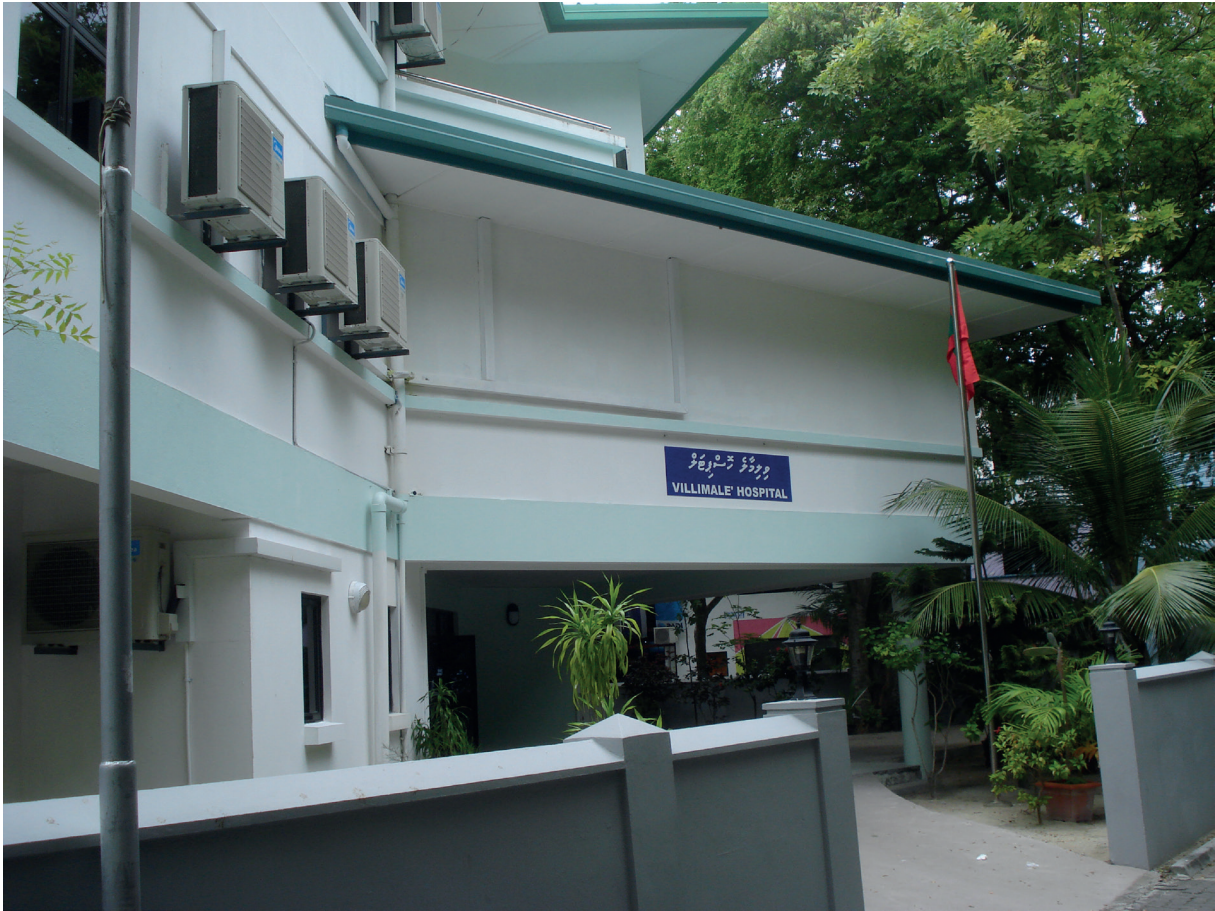
Fig. 2.2 for Question 2