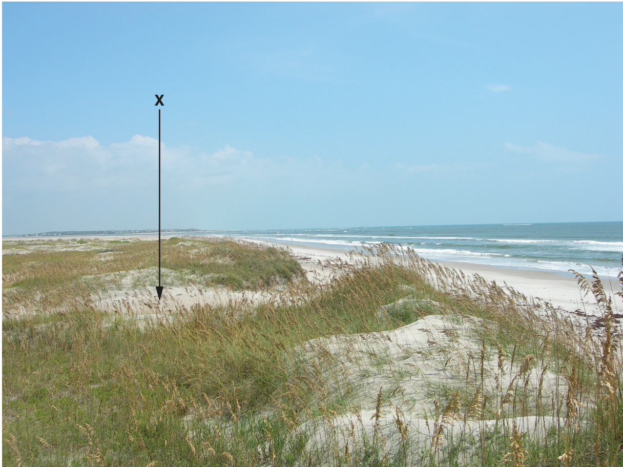
Fig. 3.1 for Question 3