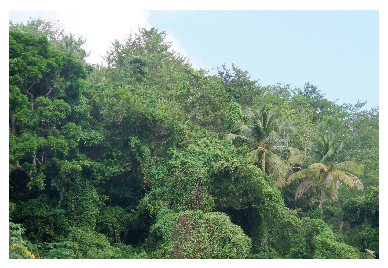
Fig. 5.2 for Question 5