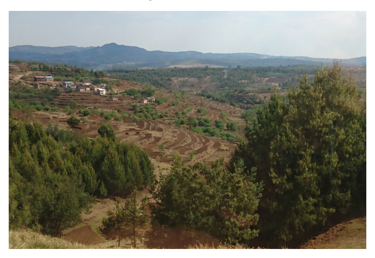
Fig. 5.1 for Question 5