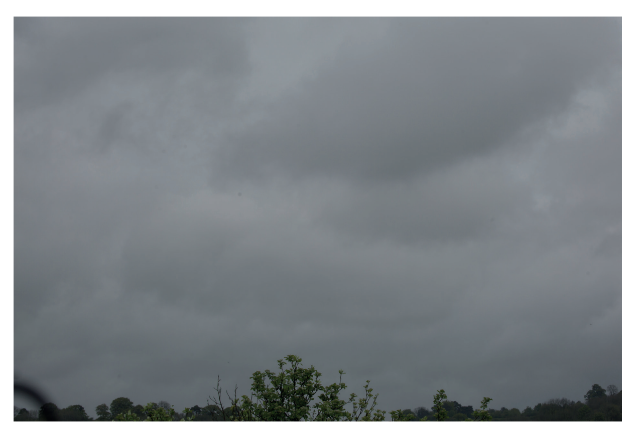
Fig. 4.2 for Question 4