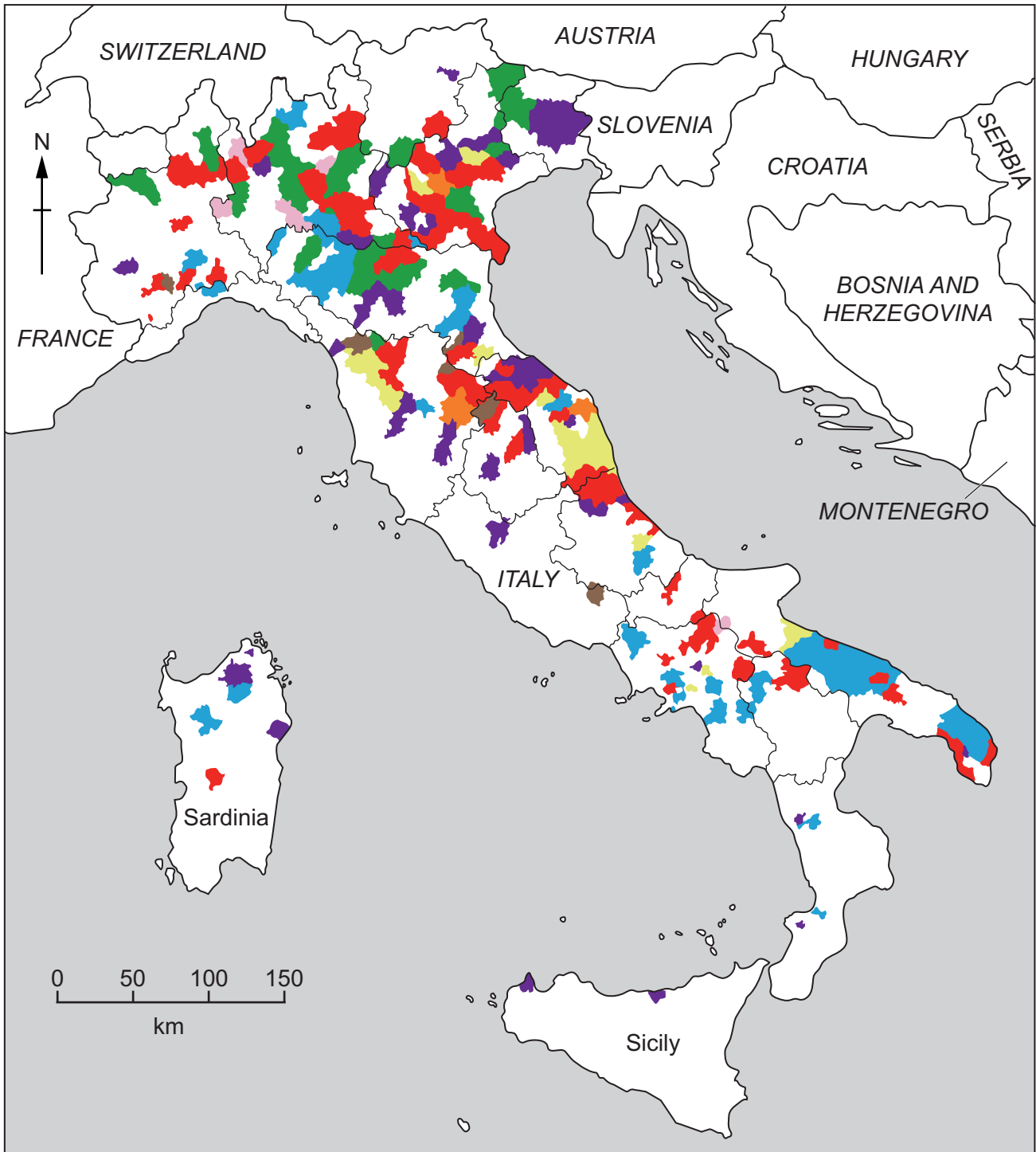
Fig. 6.2 for Question 6