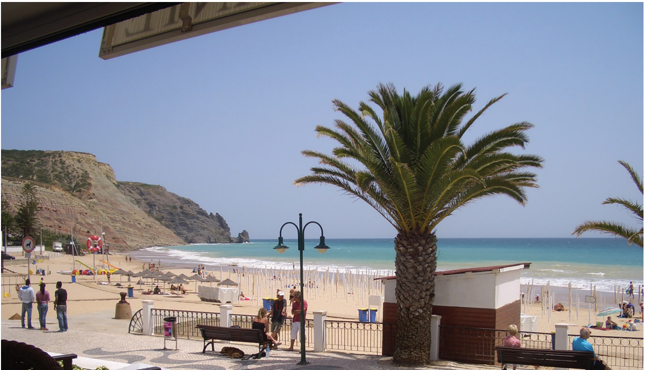
Fig. 2.2 for Question 2