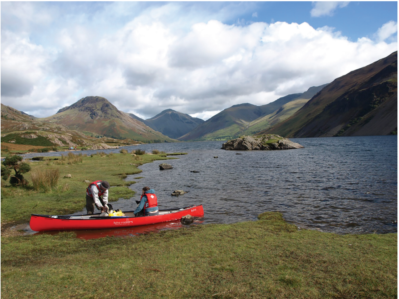
Fig. 6.2 for Question 6