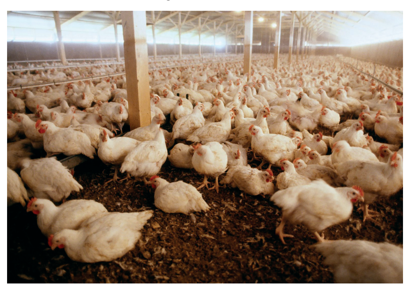
Fig. 5.1 for Question 5