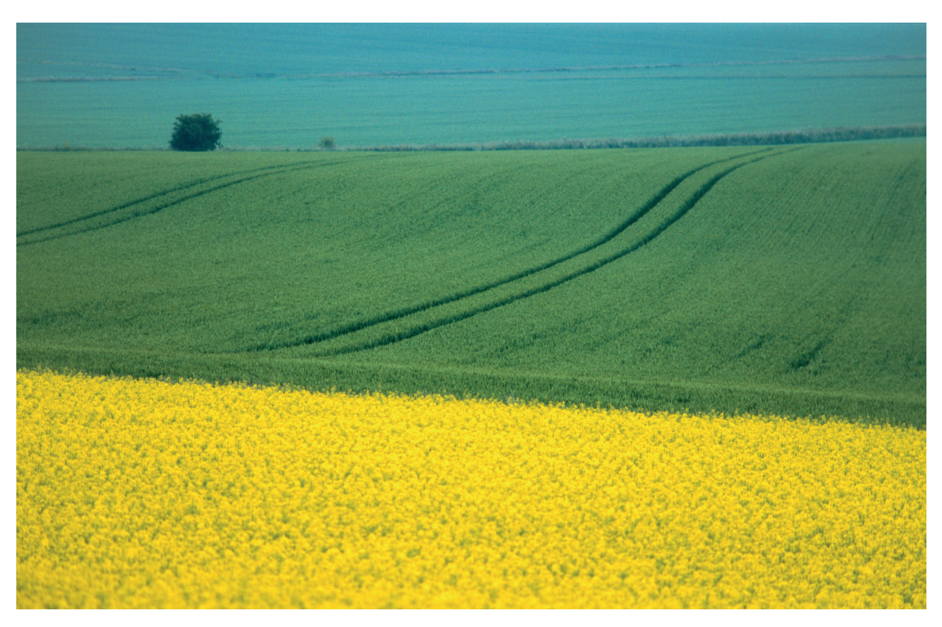
Fig. 5.2 for Question 5