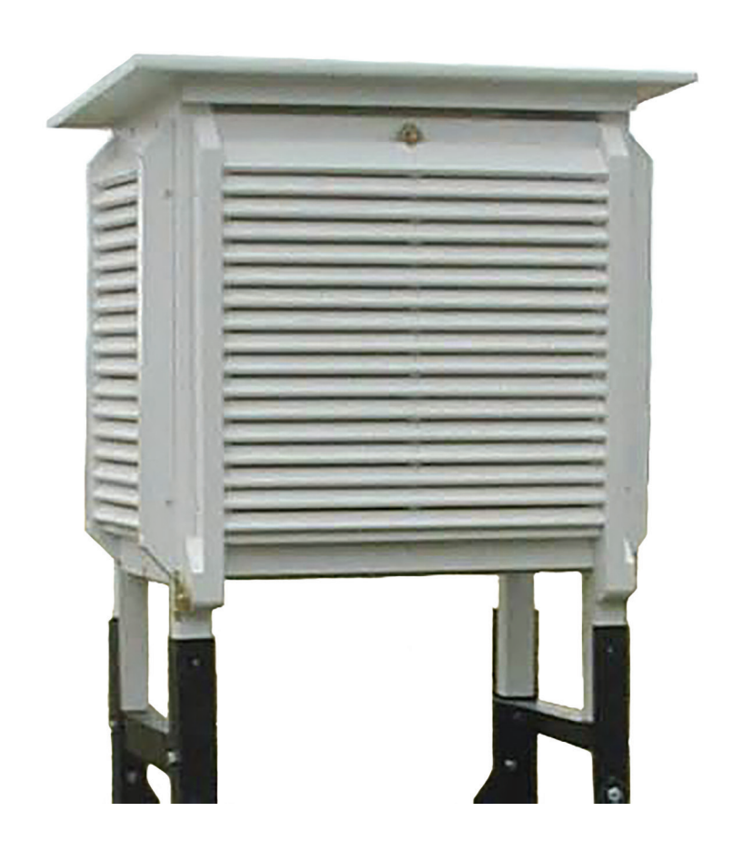
Fig. 2.1 for Question 2 A Stevenson Screen