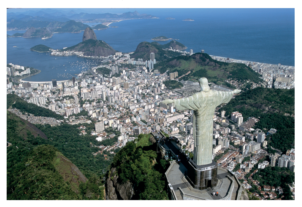
Fig. 2.1 for Question 2