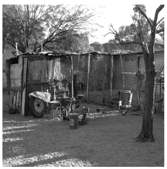
A slum area in Namibia