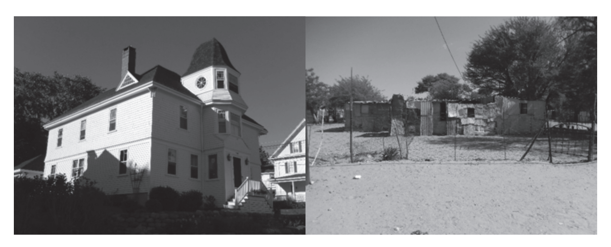
A house owned by a wealthy family in North America

Living in poverty has many consequences. Poor people find it hard to get jobs and are often unemployed. Many grow their own food and live in houses or shelters they have made for themselves. Their children go to local schools run by the government or may not get any education at all.