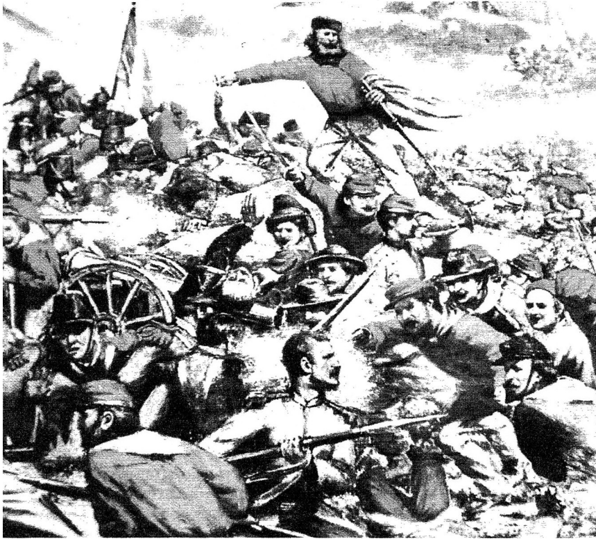
An illustration of Garibaldi in the battle of Calatafimi, published shortly after the battle in 1860.