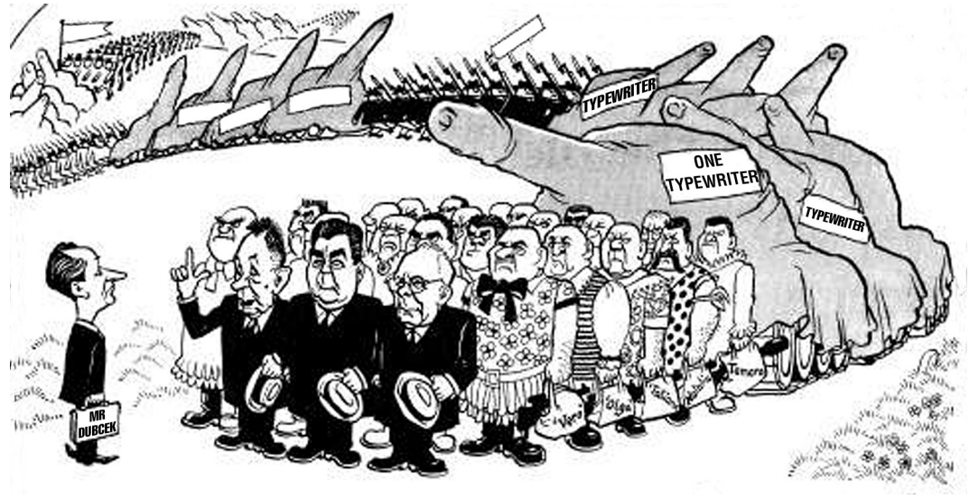
A British cartoon published on July 24 1968. The leading figures facing Dubcek are Kosygin and Brezhnev. They are saying to Dubcek 'Of course, Mr Dubcek, we've had to bring a few lady secretaries and some tea boys.'