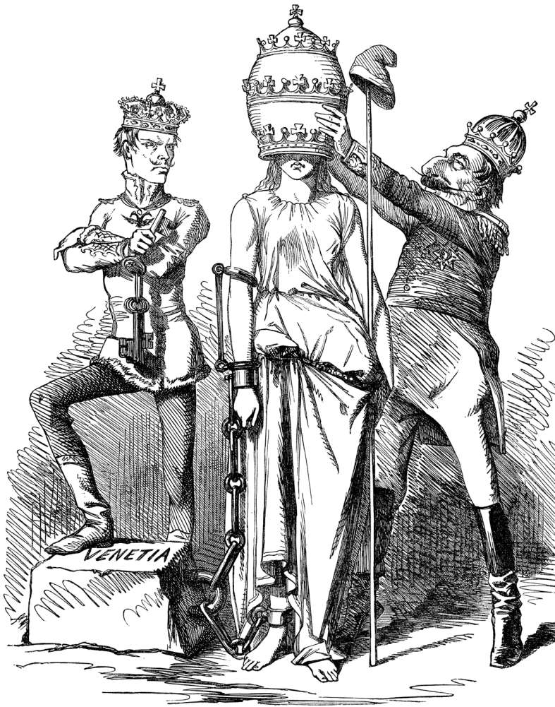
FREE ITALY

A British cartoon published in July 1859. The three figures represent (from left to right) Austria, Italy and Napoleon III. Napoleon is placing the Papal crown on Italy's head.