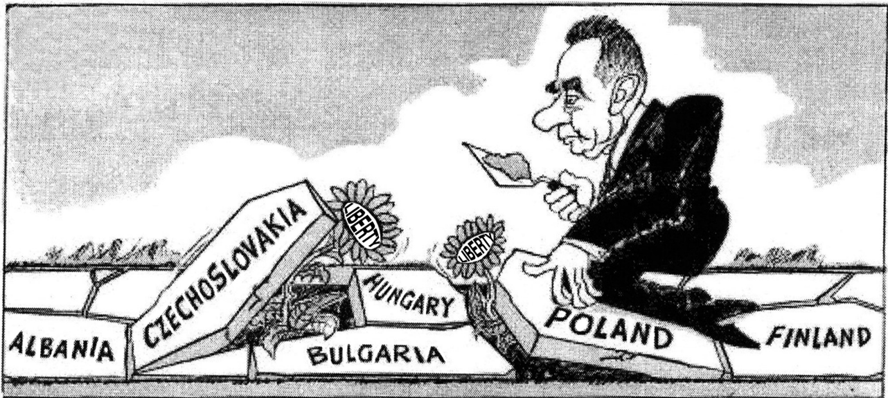
A British cartoon published in March 1968. The figure is Kosygin who was Premier of the Soviet Union.