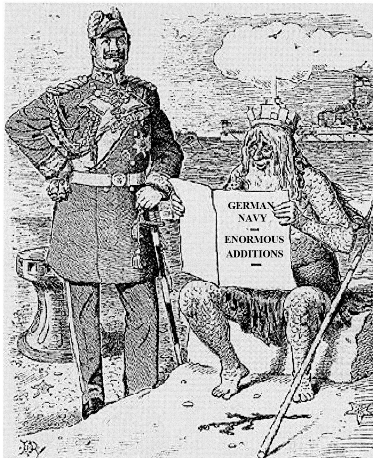
A British cartoon published in 1900. Neptune, god of the sea, is saying 'Have I got to learn German at my time of life?'