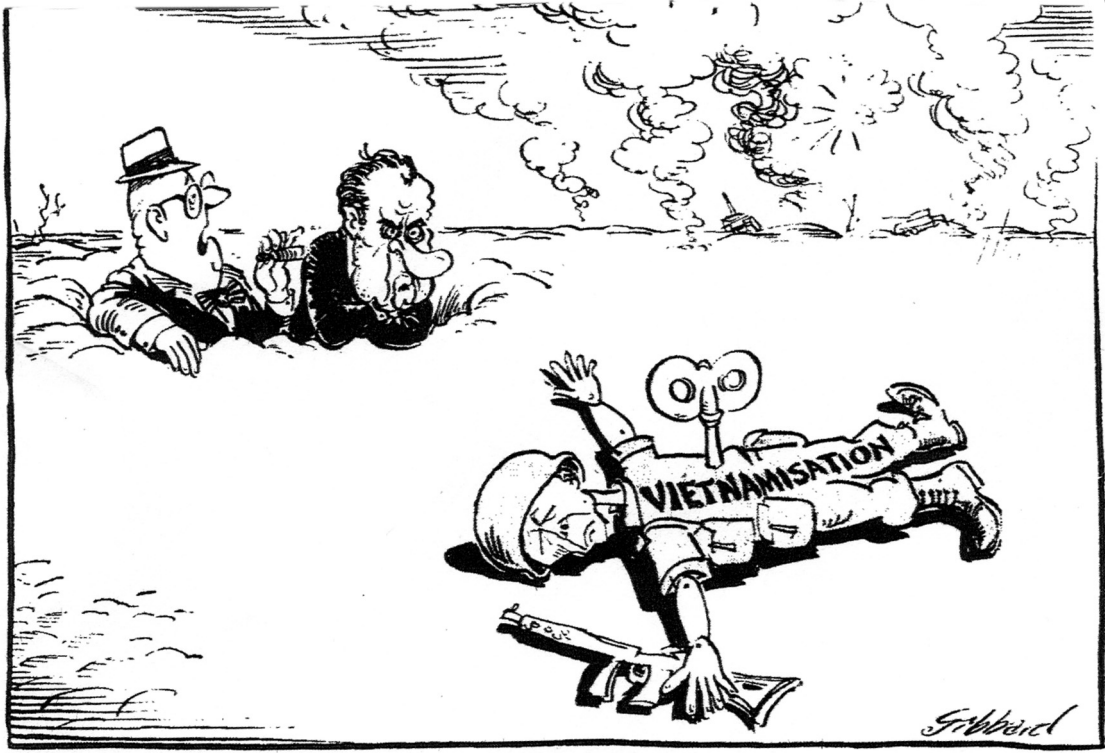
'If this boy of yours is real, how come we gotta wind him up all the time?'

A cartoon published in Britain in 1970. The man in the hat is talking to President Nixon.