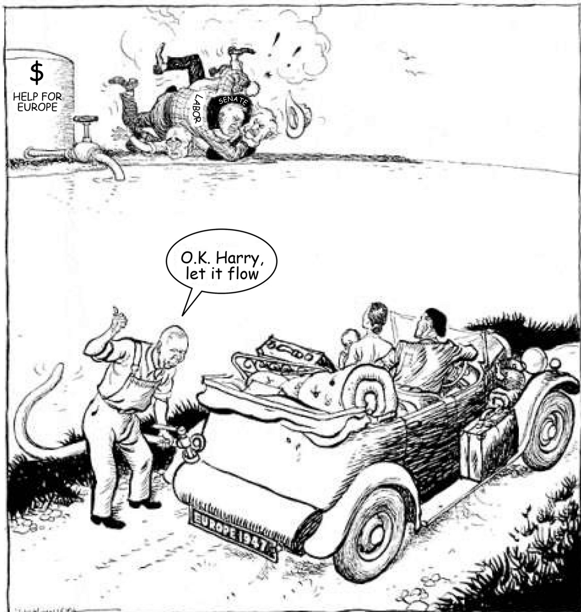
A cartoon published in Britain, June 1947. Marshall is speaking to Truman, who is held down by his opponents.