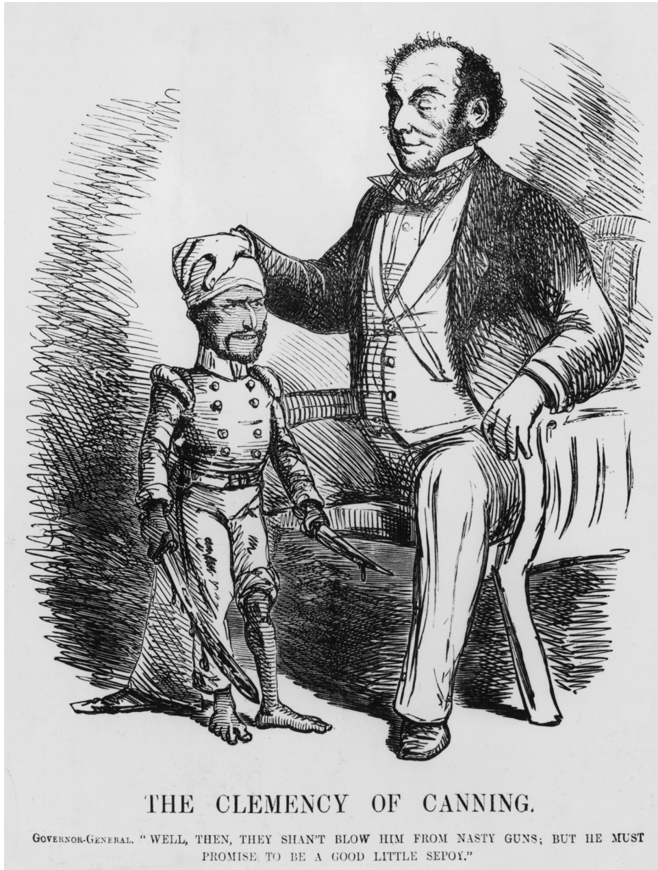
A cartoon published in Britain, November 1857. 'Clemency' means forgiveness and leniency.