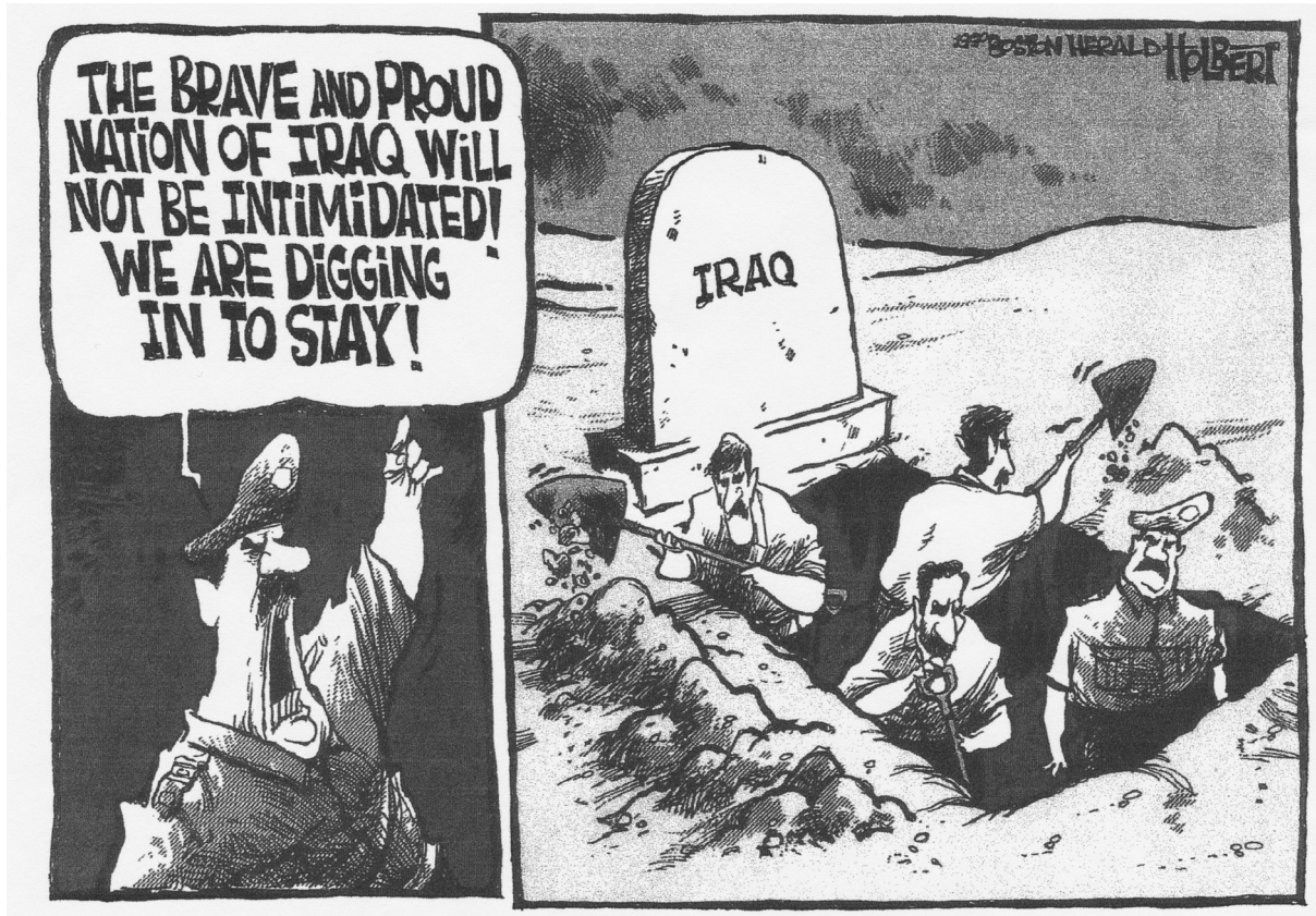
A cartoon, about Saddam Hussein, published in the USA in the second half of 1990.