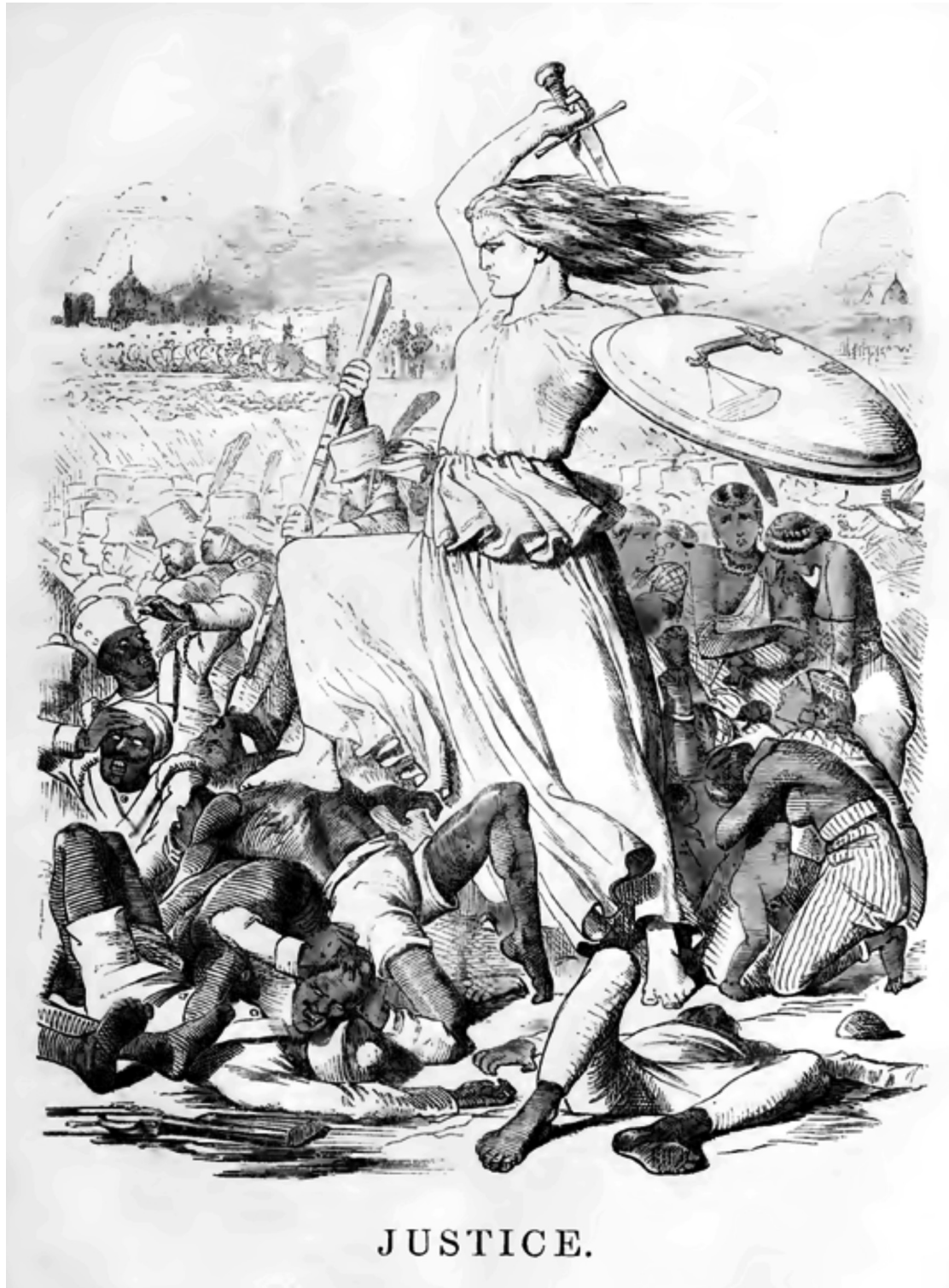
A cartoon from a British magazine, September 1857.