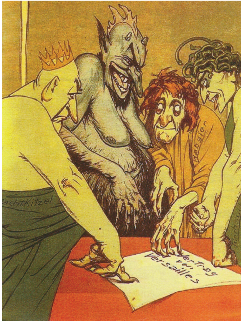
A German cartoon published in 1919. Two of the figures are labelled 'Greed' and 'Revenge'.