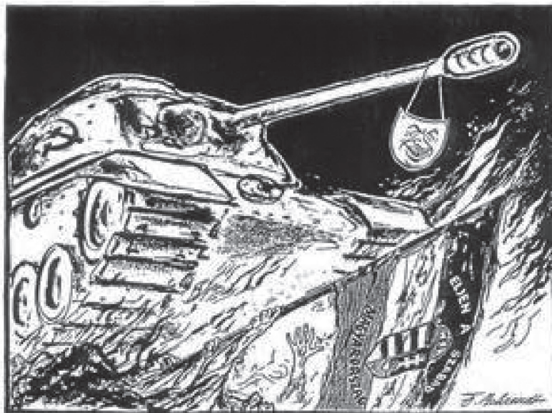
A Dutch cartoon published in November 1956. The caption read 'Peace and order are restored'.