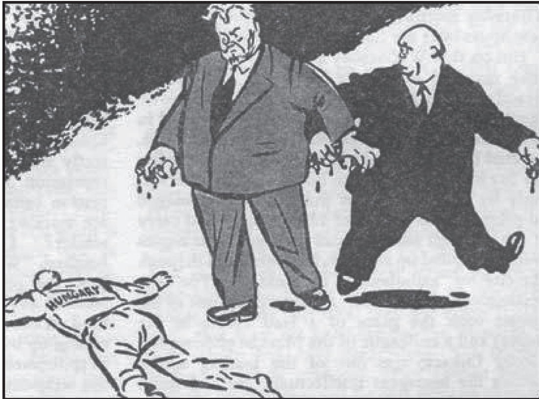
A cartoon published in an Indian newspaper, November 1956. Khrushchev is saying to a colleague, 'Let's go wash our hands in the Canal.'