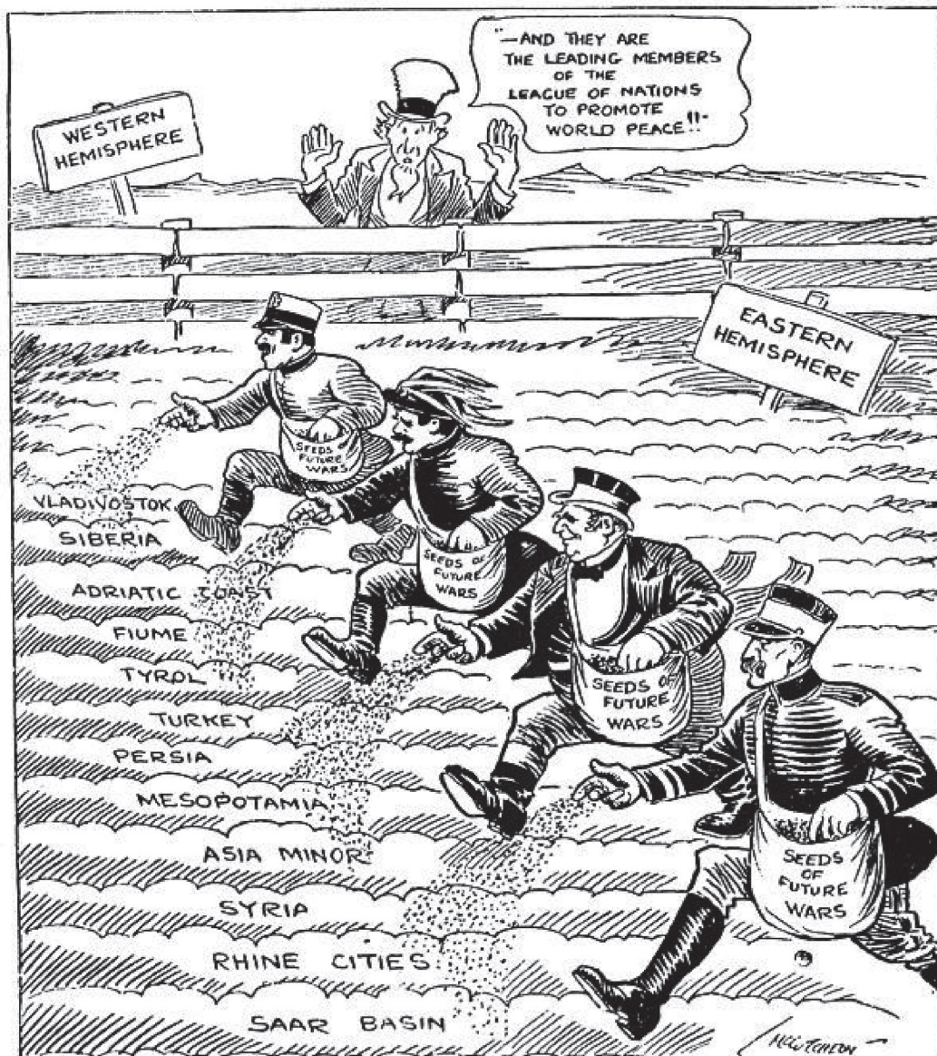
An American cartoon, 1920.