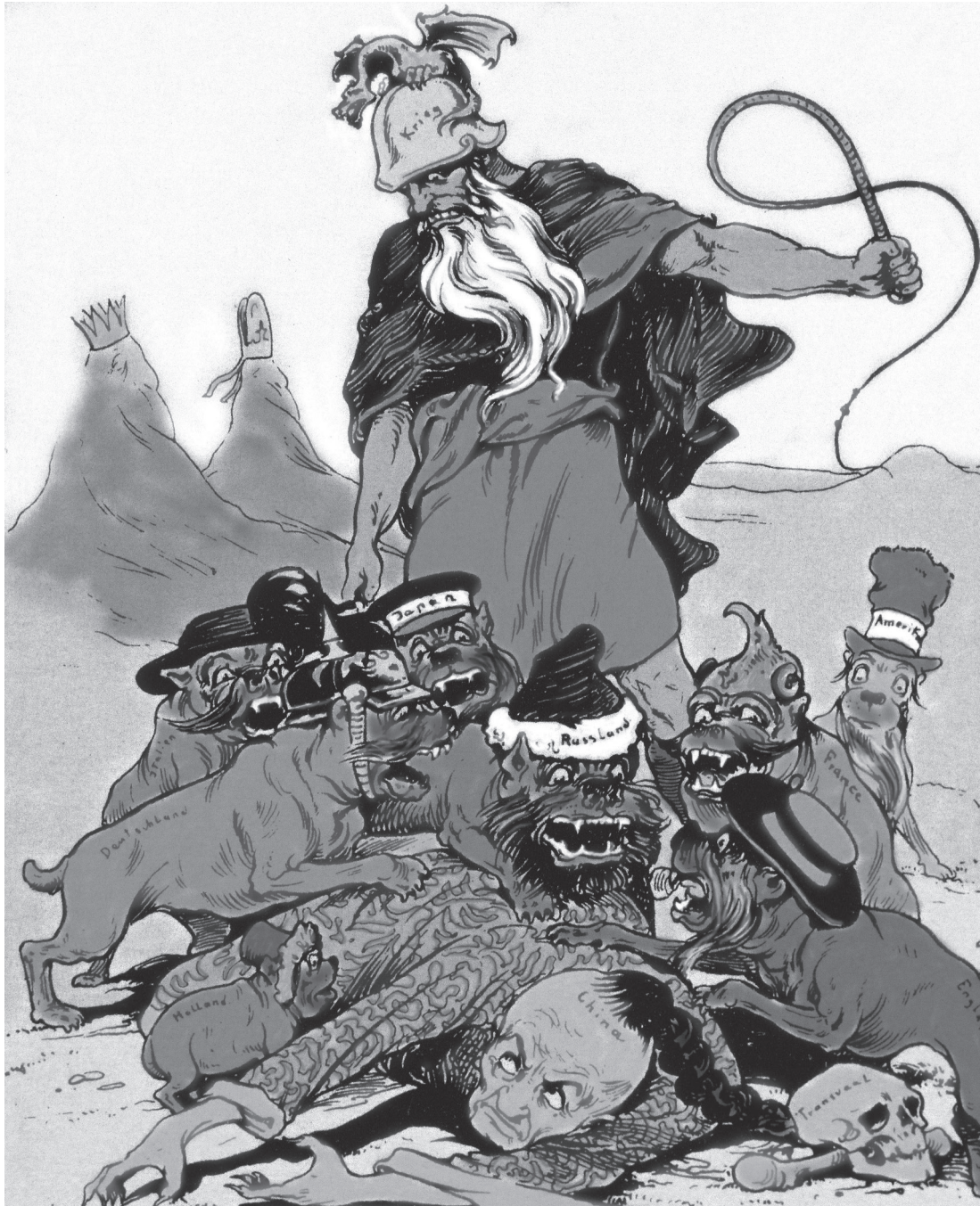
A German cartoon, January 1901. The figure with the whip represents the spirit of war.