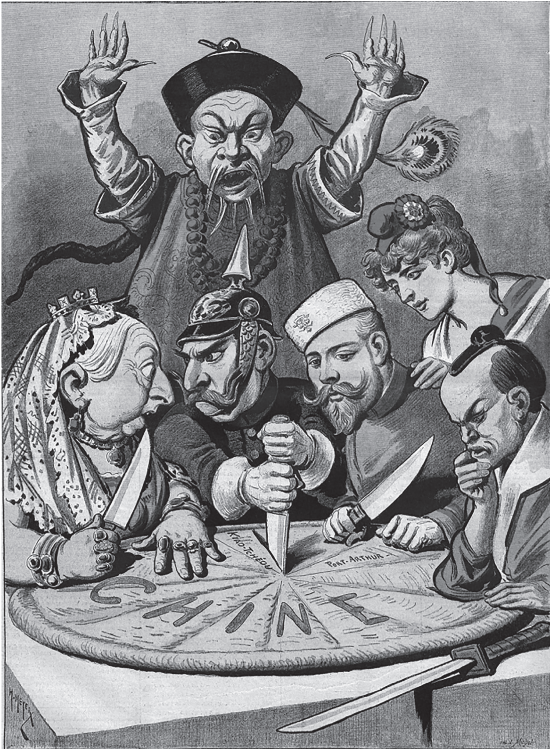
A cartoon published in a French magazine, 1898. The caption reads 'China – the cake of kings and of emperors'. The countries around the table are, from left to right, Britain, Germany, Russia, France and Japan.