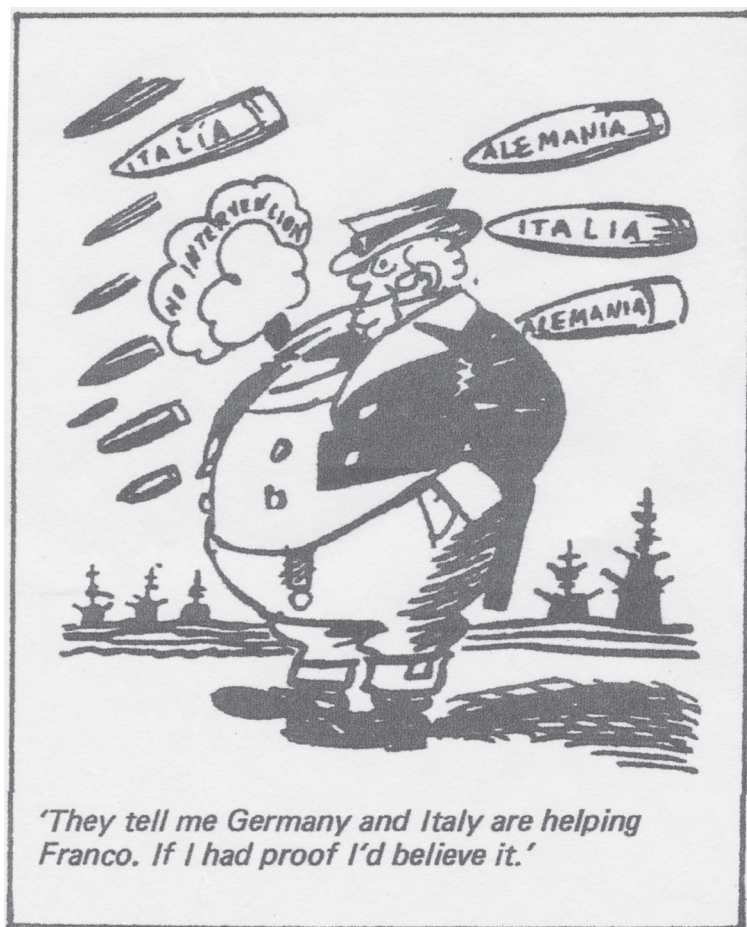
A cartoon published by the Spanish Republican Government in 1938. The figure in the center represents Britain.