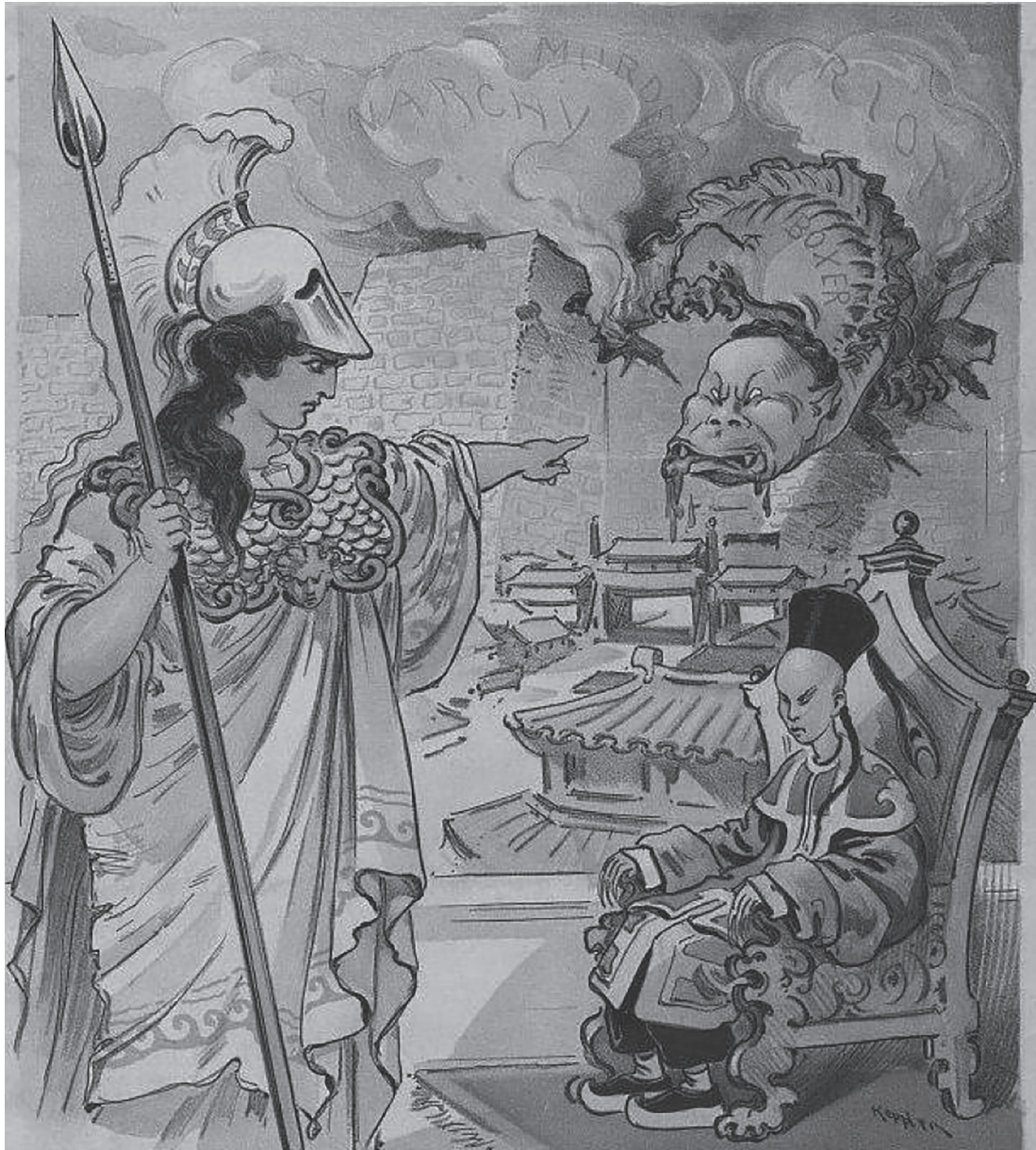
A cartoon published in an American magazine, August 1900. The caption reads 'The First Duty. Civilization speaking to China: "That dragon must be killed before our relationship can be improved. If you don't do it, I shall have to."'